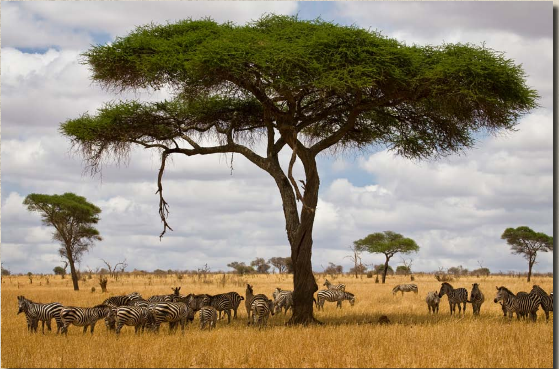
Zebras under an umbrella acacia