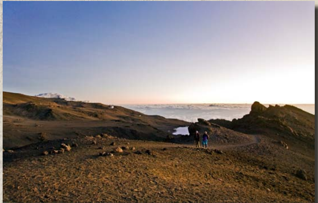
Climbing Stella Ridge, with the Eastern Ice Field in the background

Shortly before sunrise you reach Stella Point, and the slope of the trail eases significantly. You are in the home stretch, now 45 minutes from the summit. You take a break on Stella Ridge, watching the sun rise over the clouds. Watching a sunrise at 19,000 ft, using only your own energy to reach that point, is a feeling hard to find the words for. A sense of calm and awe for mother nature fills your mind. You gaze upon the snows and glaciers of Kilimanjaro in the dawn light. The feeling is ethereal and you now know why you chose to climb this mountain.