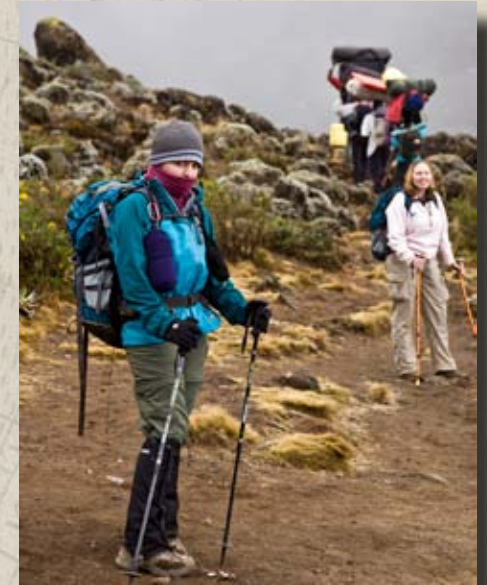
Ready for the Breakfast Wall

Since you are only going to Karanga today, you can afford a later start, missing most of the crowd on the wall.