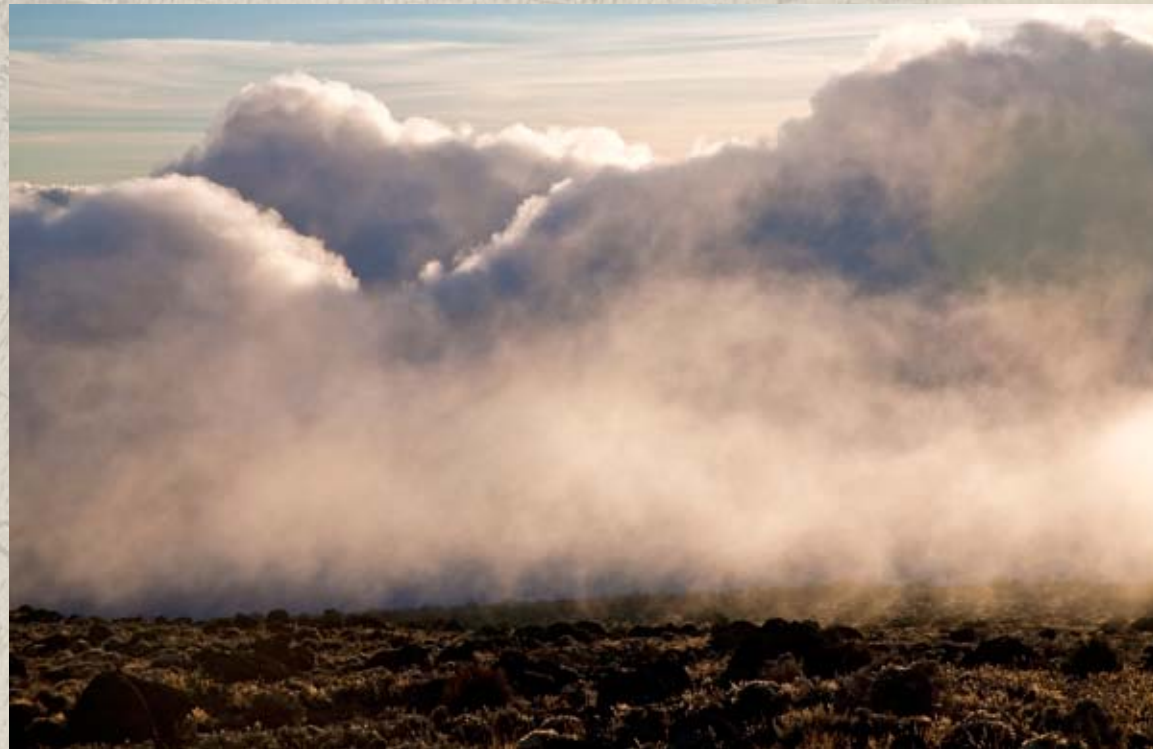
The clouds roll in on the Shira Plateau