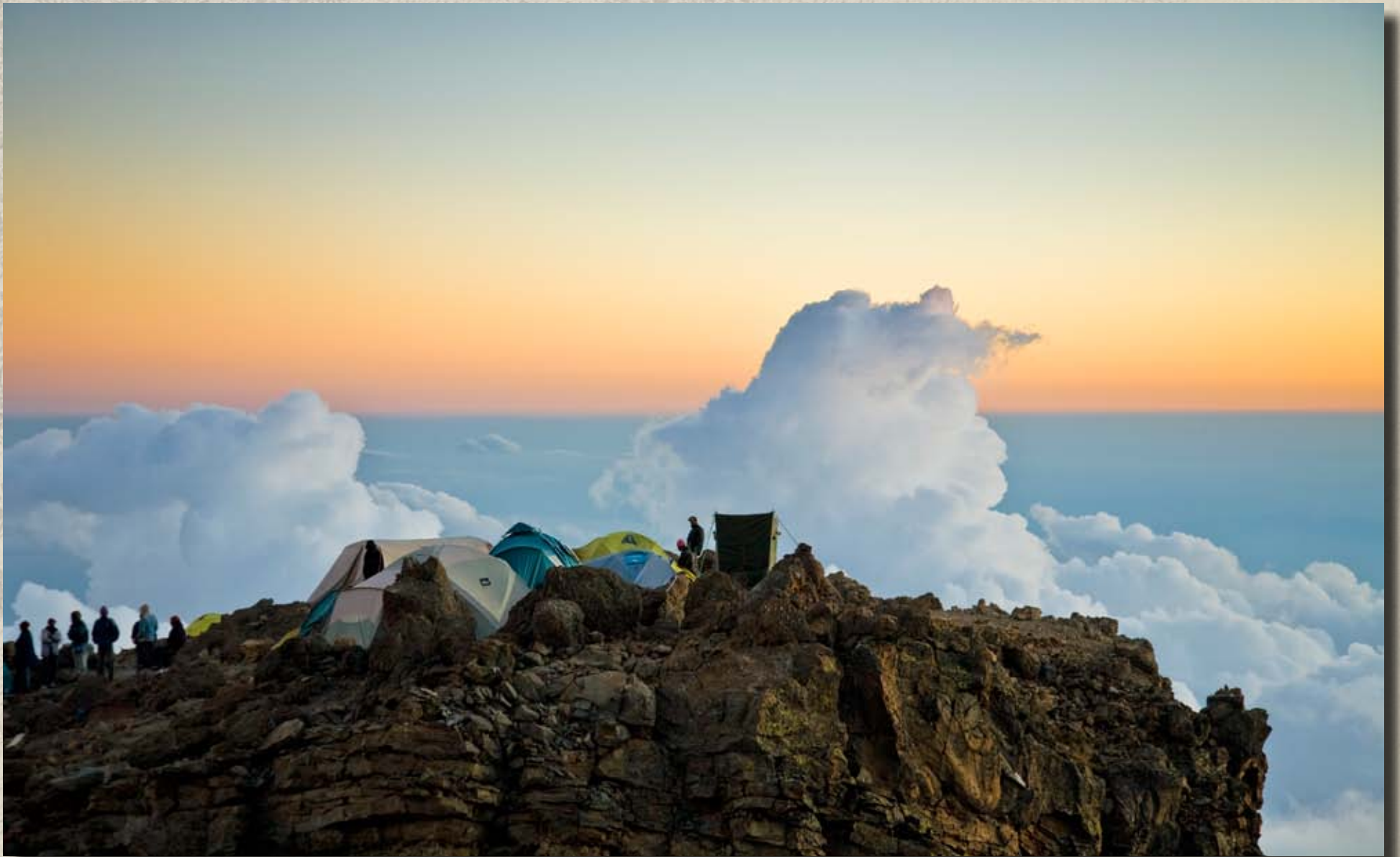
Barafu Camp at sunset