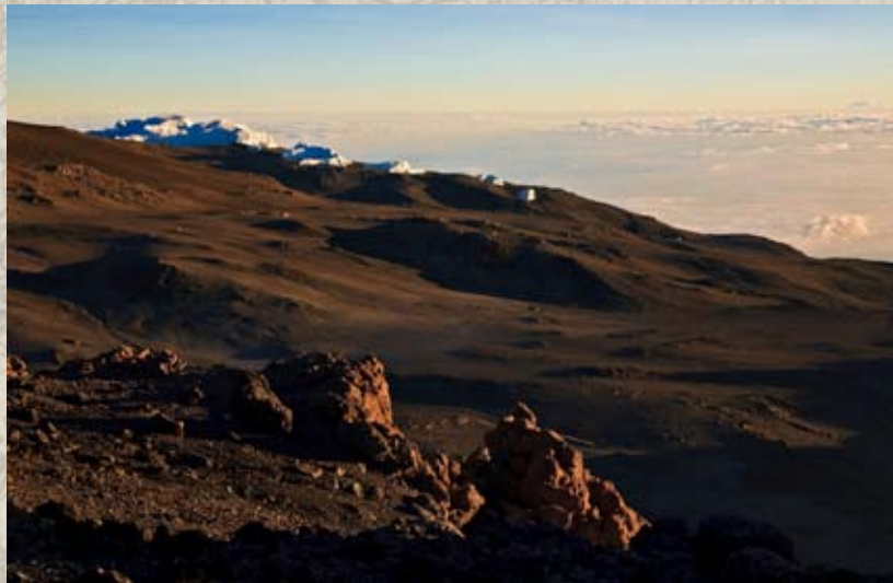
The Eastern Ice Field

When you finally arrive at the summit 8 hours later there is a sense of accomplishment that is undeniable. You feel deservedly proud as you stand on the rooftop of Africa, gazing out over the clouds, the crater, and the glaciers.