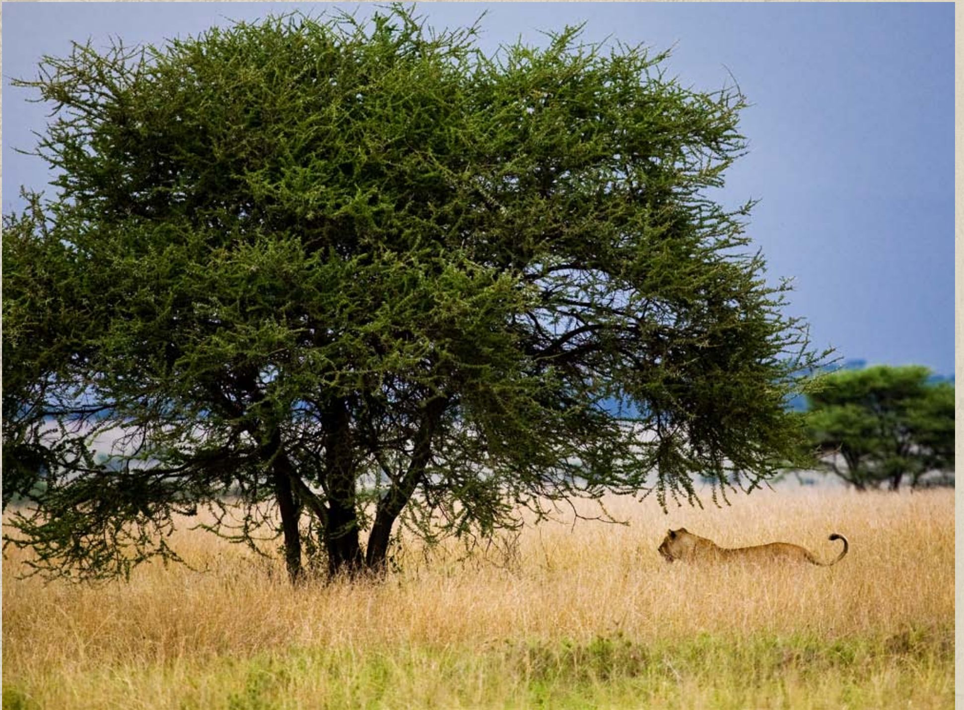
Stalking the Serengeti Plains