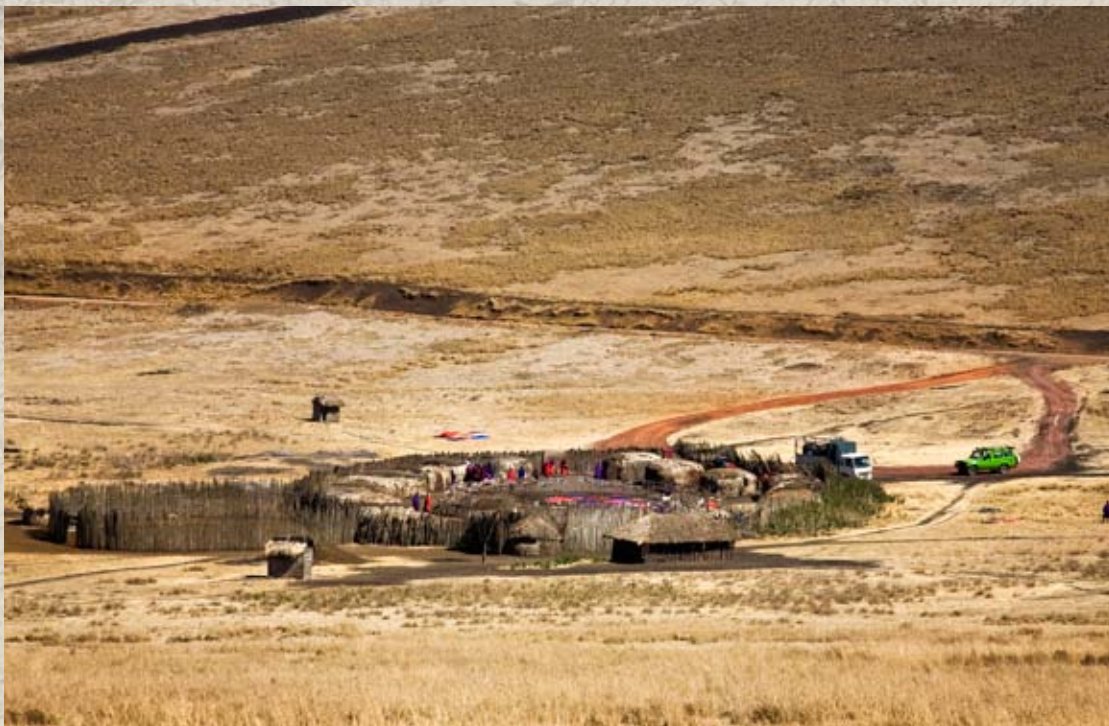
A typical Maasai village

There are an estimated 900,000 Maasai in Tanzania and Kenya.