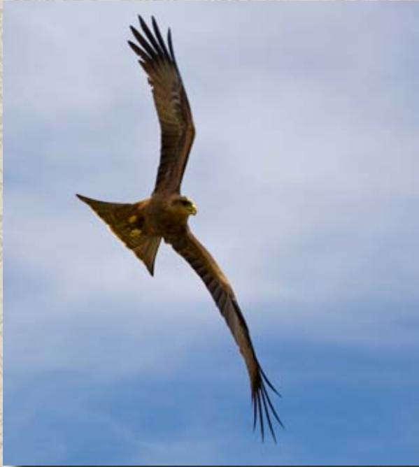
A black kite in flight