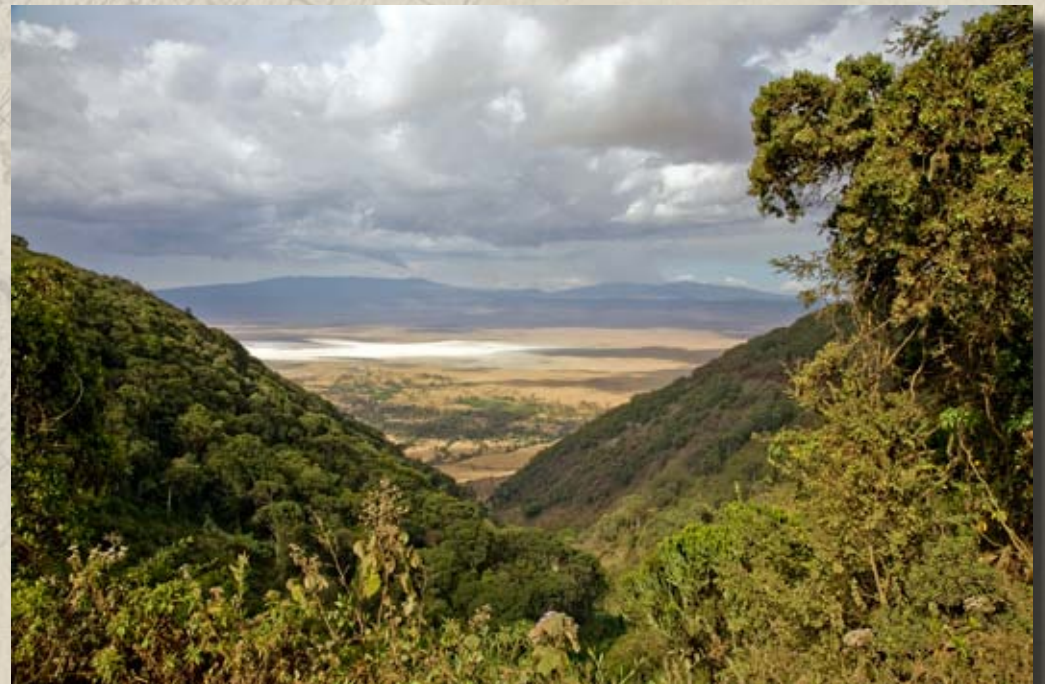
Ngorongoro Crater, from the road ascending out.