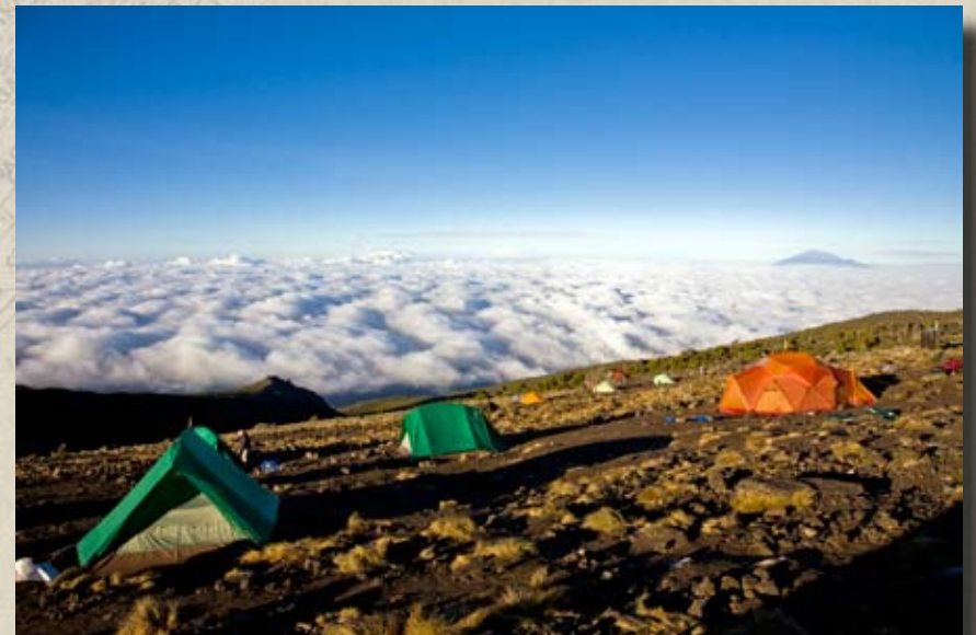
Above the clouds at Karanga