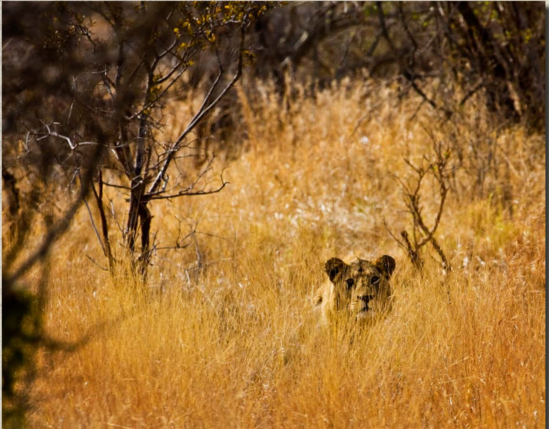
Hidden in the grass—a male lion watches over his pride