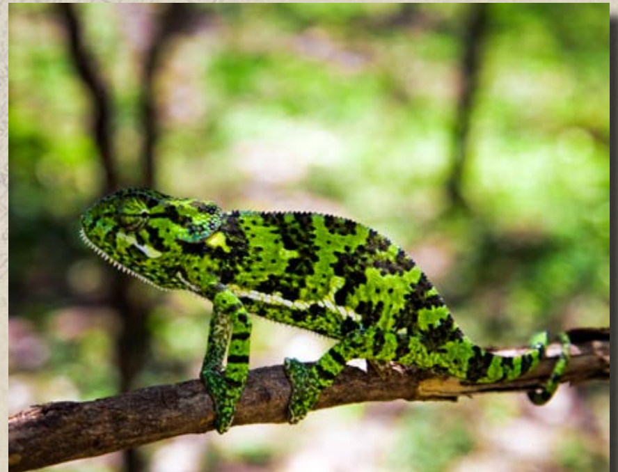
A chameleon roaming the brush