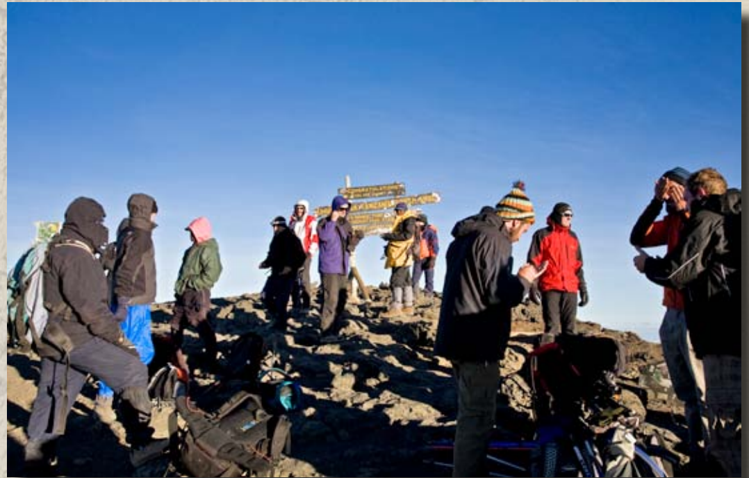
A group of climbers gather on the summit

Climbing Kilimanjaro is a serious undertaking. The weather can be erratic with storms, rain, and snow possible. The temperature can range from balmy to -20 degrees F. Approximately 10 climbers and 10-20 porters die each year on the mountain. In 2005 there were 997 evacuations from the mountain and helicopter evacuations are not available. Many, if not most, of the incidents are directly related to a lack of preparation and/or safety. Climbers who sign up with groups on the streets of Arusha are not always advised of the weather, gear and clothing needs, or how strenuous the climb is. They are taken up the mountain too quickly, by guides who are more concerned with the size of the tip than the safety of the clients.