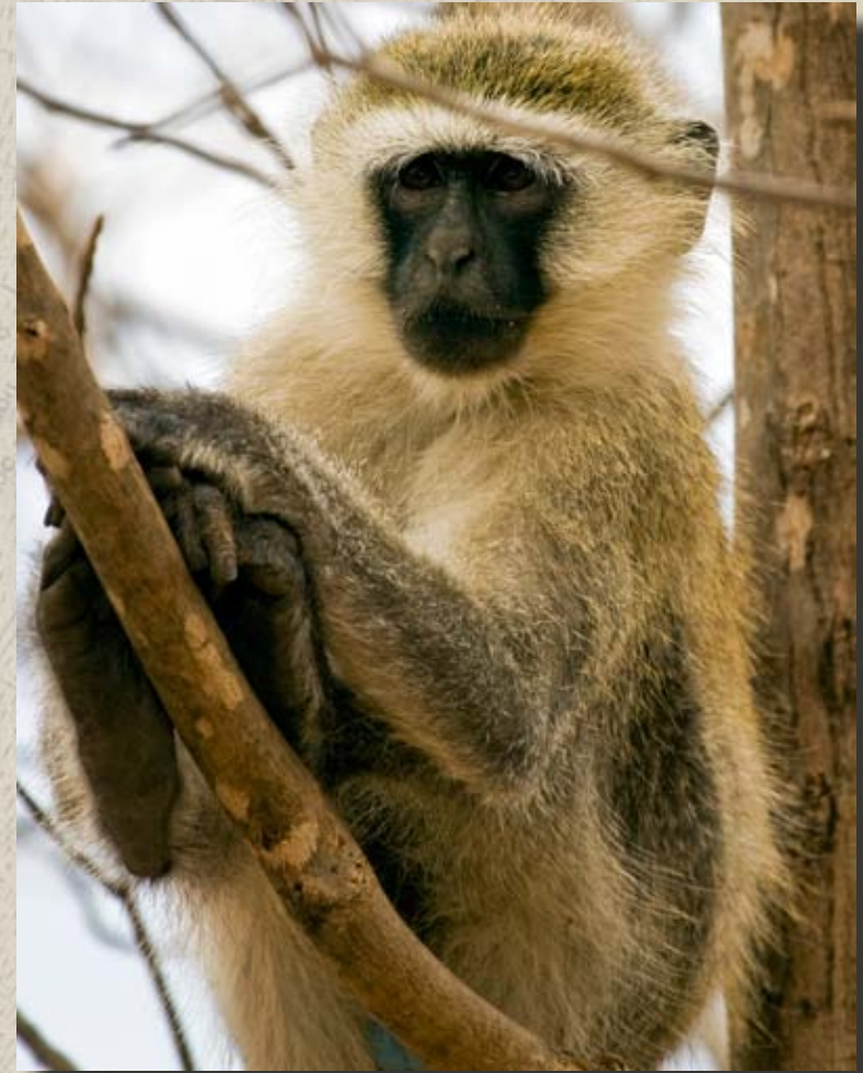
Time to relax

You will see vervets both at the lodges outside of Arusha and at the national parks. At the parks they are frequently close to the designated picnic and rest areas.