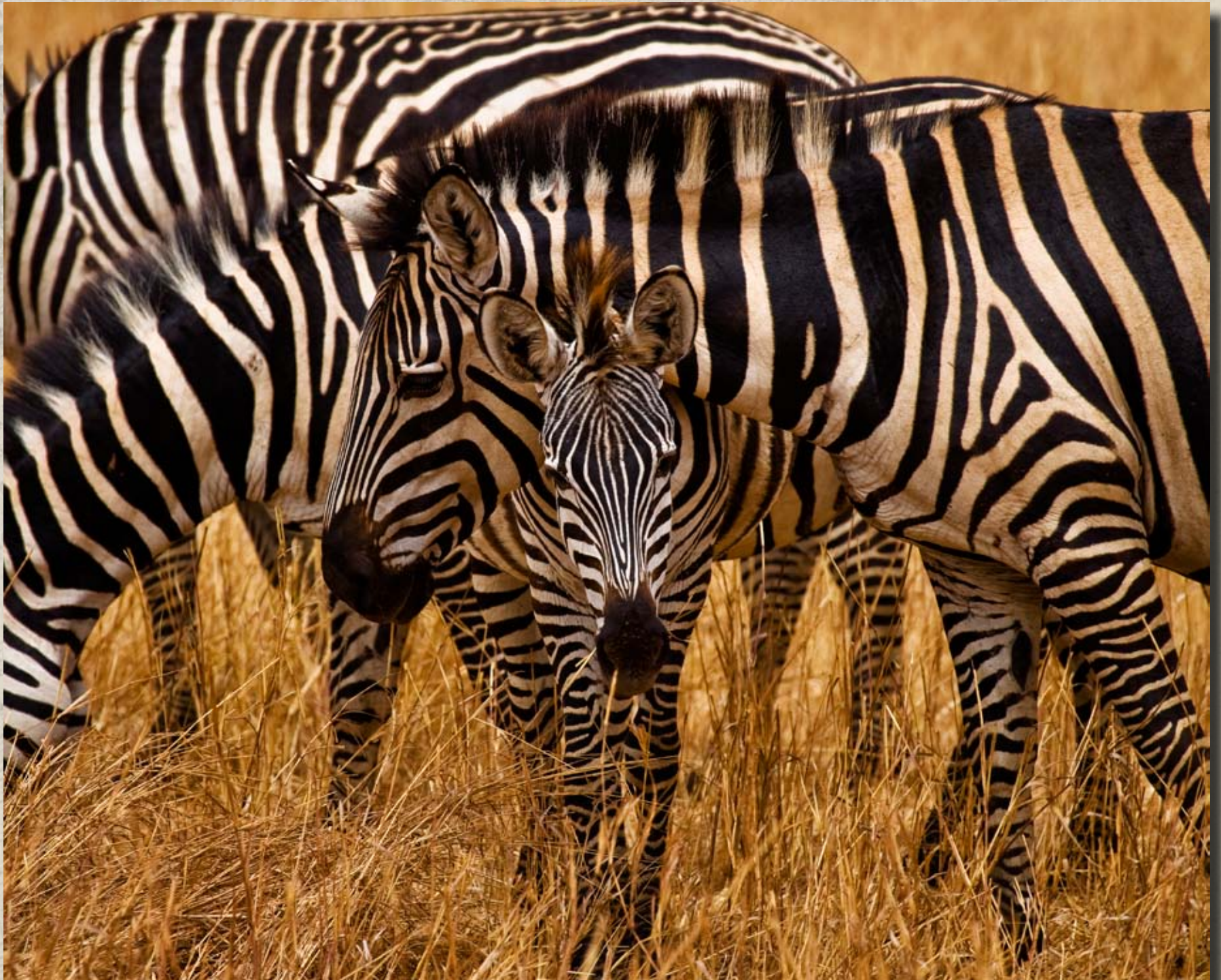
A mother's love—a zebra and her young