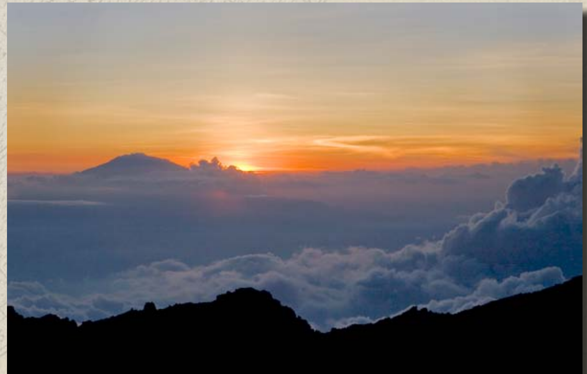
The sun sets on Barafu