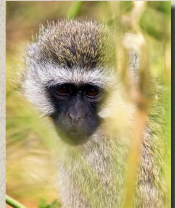
A vervet monkey seen in Ngorongoro

Ngorongoro Crater is only a small part of the Ngorongoro Conservation Area, which covers 8288 sq. km (3200 sq. miles) and includes the crater highlands together with vast plains, grasslands, bush, and woodlands. It is part of the larger Serengeti ecosystem and includes Olduvai Gorge, the site of many hominid fossils.