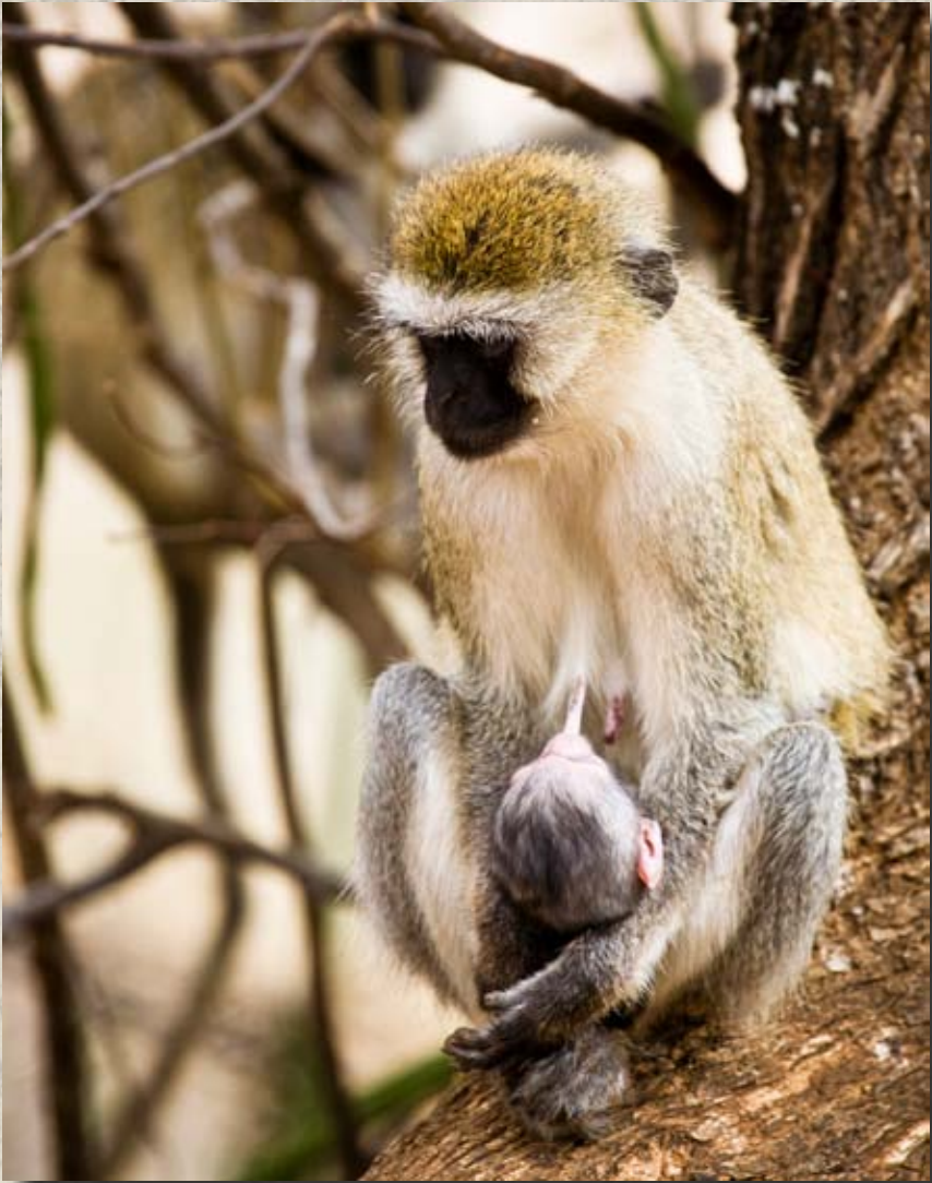
A mother vervet breast-feeding her infant