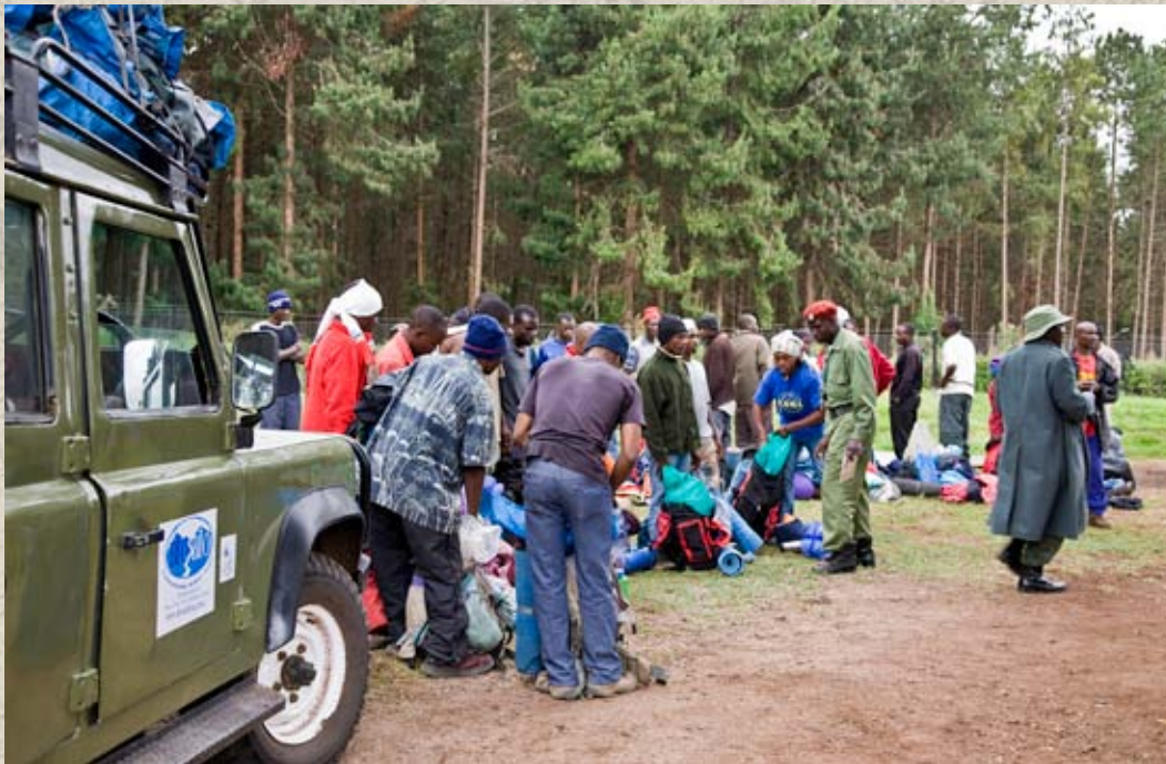
Porters undergoing an inspection, checking that their gear is adequate