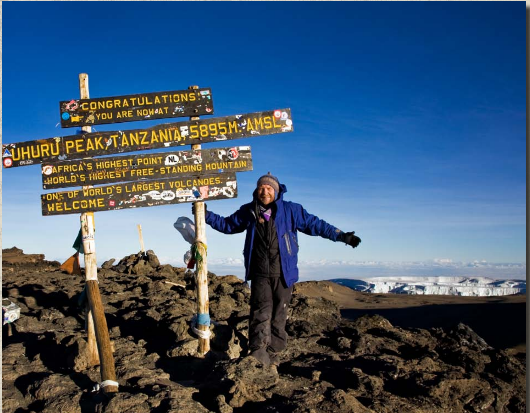
Success-The view at the top, and what a view it is