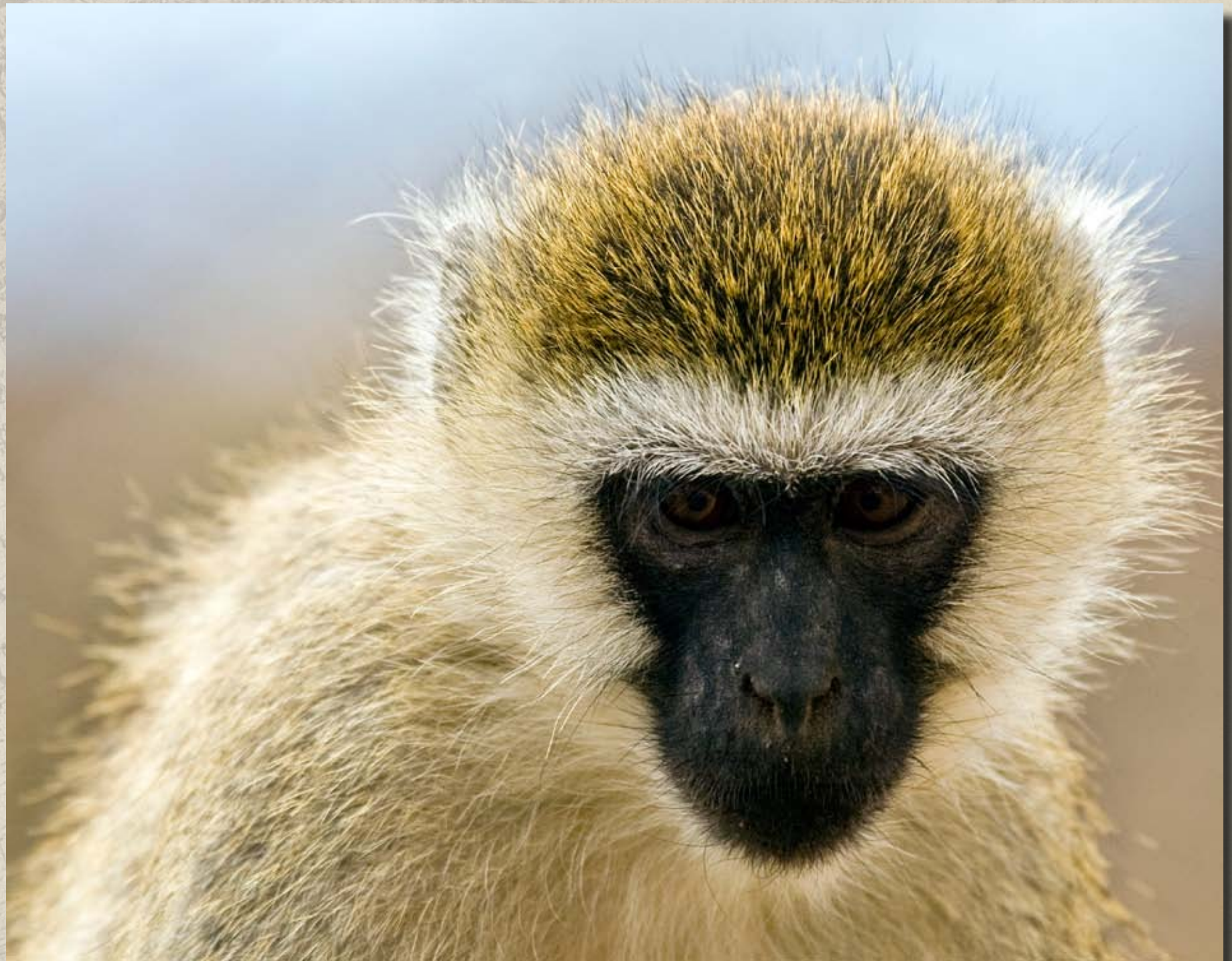
A vervet monkey in portrait