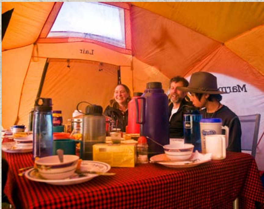
Enjoying some company and drinks in the dining tent

With all the hard work spent on the trail, you will need energy to sustain your efforts. That is where the cooks enter the picture. You will be treated to meals made from scratch, ranging from eggs, toast, and potatoes in the morning to homemade soups, pastas and casseroles at night. Bio Bio's cooks are experts in gourmet camp meals that rival the meals provided at the luxury safari lodges you will also be staying at later in the trip.