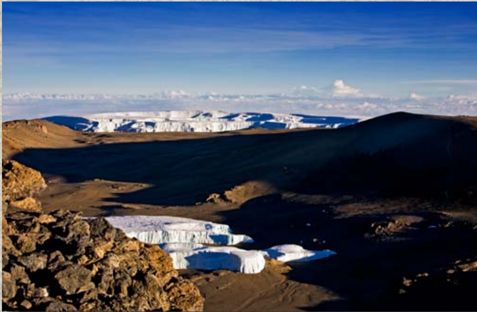
The Furtwangler Glacier, in the crater below Uhuru Peak. The Northern Ice Field is seen in the background

Once back at camp it is time for a nap then a hot lunch. After lunch you start the 5 hour trip down to the low camp, Mweka, and the last night on the mountain. Mweka is at 3100 m, about 10,300 ft and is below the treeline, in the cloud rain forest on the lower slopes of Kilimanjaro. The next morning it is time to say goodbye to the porters and spend the last 4-5 hours on the mountain as an easy stroll through the rain forest. You marvel at the change from the slopes above. The air feels almost thick, after a week above 12,000 ft. Once off the mountain it's time for lunch, and a bus back to Arusha. It's time to prepare for the Safari.