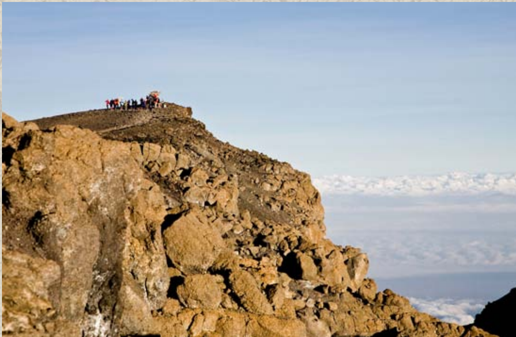
Climbers at Uhuru Peak, the highest point on Kibo, seen from Stella Ridge

This is where Bio Bio excels. You will be led by experienced, knowledgeable guides who place a priority on your safety. The guide to client ratio will match or exceed that of any other group on the mountain, allowing for people to travel at different speeds and for clients to return to camp with a guide, as needed by the circumstances. You will never be asked to do anything you are not capable of and will never be pushed beyond your limits. Bio Bio is one of the few, if not the only guiding service that carries both supplemental oxygen and a gamow bag. They make sure every client reaches their own personal summit, whether that is at the physical summit or not, in a safe, friendly, and encouraging environment. Bio Bio will provide you with information and preparation that will give you the best chance for success.