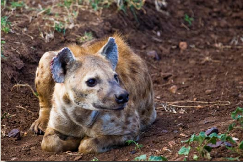
A spotted hyena