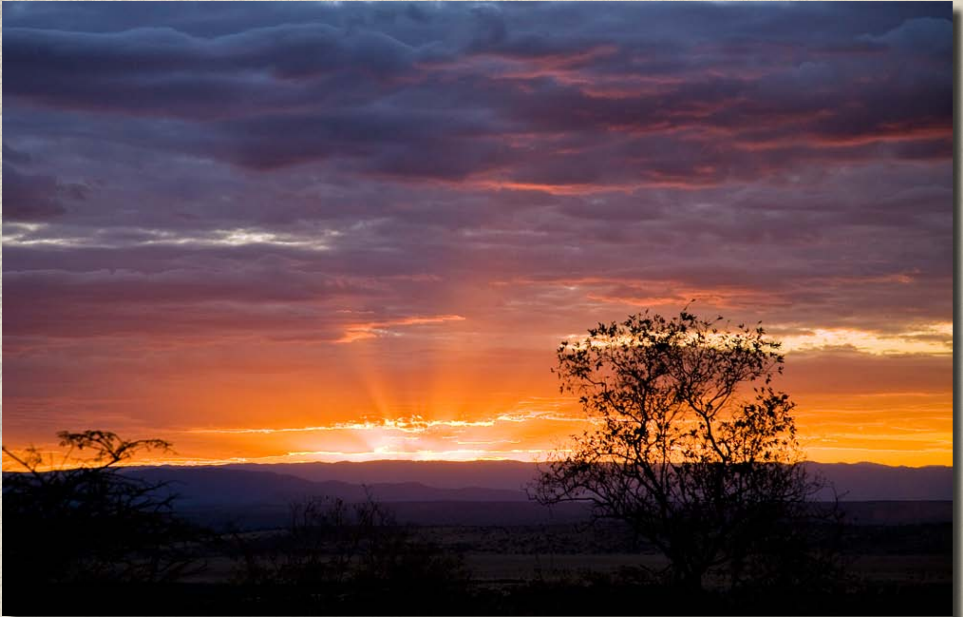
Sunset over Tarangire National Park, taken from the Kikoti Tent Lodge