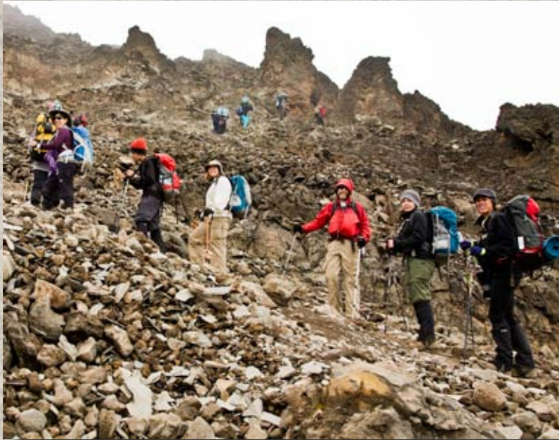
Climbing towards Barafu

You will arrive at Barafu in time for a warm lunch and hot drinks. Then it is time to relax, hydrate, and especially rest. The start of the summit attempt will be at 11:30 p.m. that night. There is an increased chill in the air that was missing from the lower camps. The air is much thinner and simple tasks have become harder. Conserving energy is the key to success. That and hydrating til you don't think you can ever drink water again.