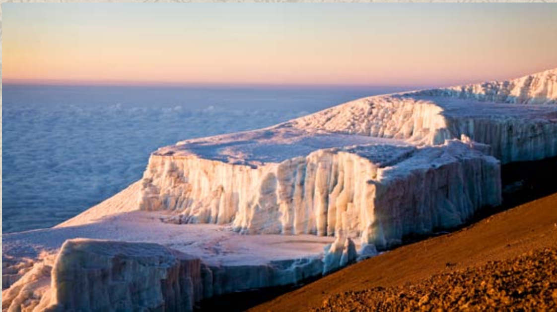
The Rebmann Glacier

You feel a sense of gratitude that you were able to see Kilimanjaro's glaciers before they are gone. Having researched the mountains before the trip you know that the glaciers of Kilimanjaro have become symbolic of the havoc global warming and deforestation is causing. You know that since 1912, Kilimanjaro has lost over 80% of its glacial ice and that it has been estimated that they will completely disappear sometime between 2020 and 2050. You have learned that it is probably decreased precipitation, rather than increasing temperatures, that is the cause.