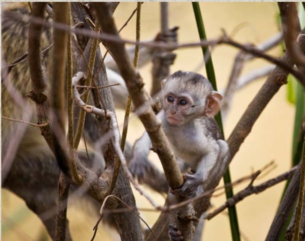
A juvenile vervet monkey

A small population, taken as pets by slavers, exists in the Caribbean, on the small islands of Barbados, Saint Kitts, Nevis, and Saint Maarten.