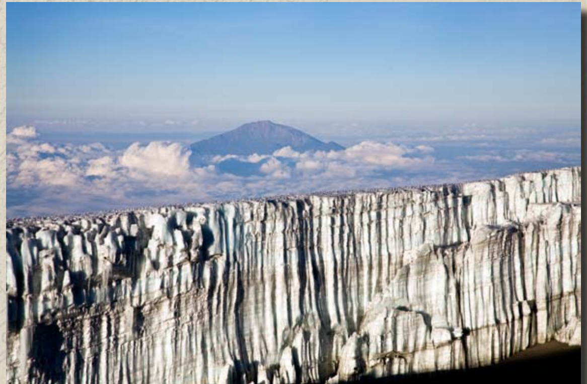
The Southern Ice Field, with Mount Meru in the background