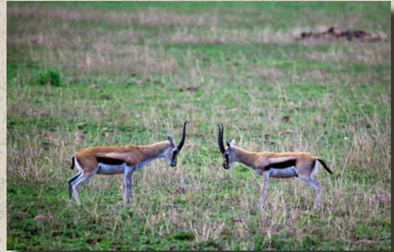
Two Thomson's gazelles facing off