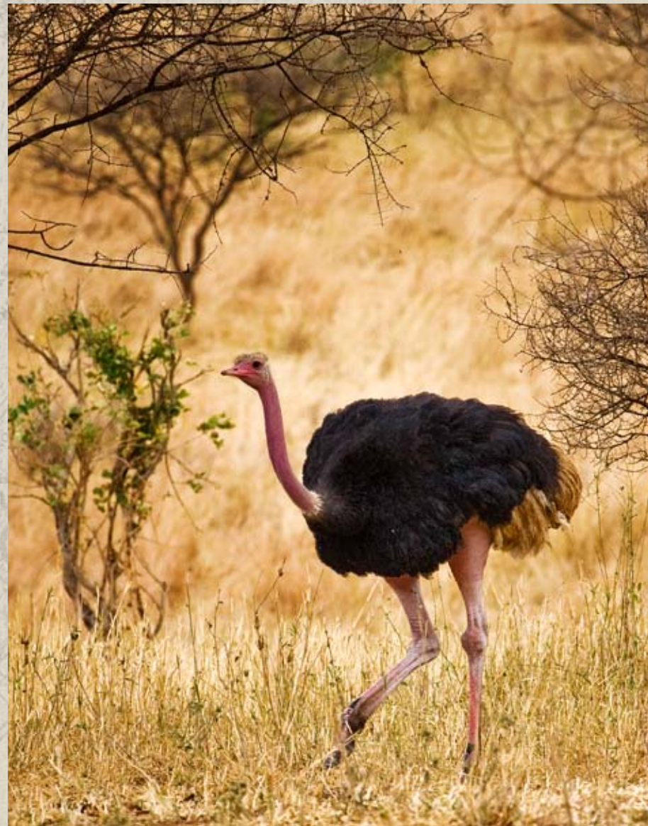
An ostrich, roaming the grasslands of Tarangire

As you crisscross Tarangire you will see herds of elephants wading through the high grass in search of water. Zebras wallow in a mud hole. Giraffes grace the grasslands, stretching for their meals in the high acacia trees. Lions stalk the grasslands in search of prey. If you are lucky you will come on a fresh kill. If you are even luckier you will see a kill in action.