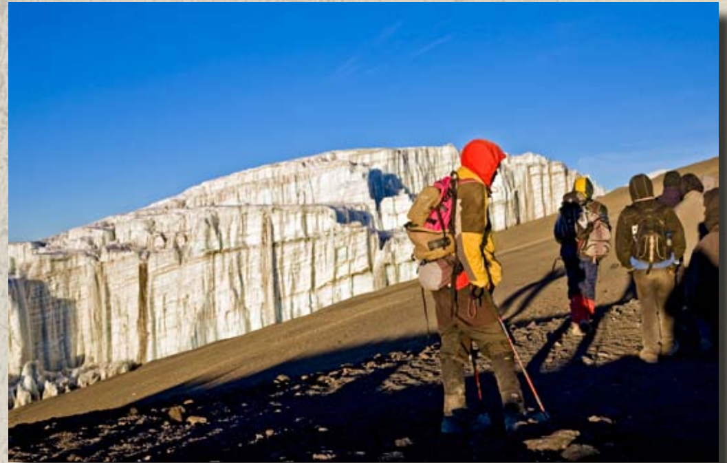
Climbers preparing for the last few meters to the summit at Uhuru Peak, the highest point on Kibo. The Southern Ice Field is seen in the background

As you climb Stella Ridge in the growing morning light you marvel at the grandeur of the surrounding glaciers. While the air is thin and the oxygen sparse, the slope is gentle and a welcome change from the steep climb throughout the night. You can see the people ahead of you gathered on Uhuru Peak, the high point at 5896 m, and you realize you will be there shortly.