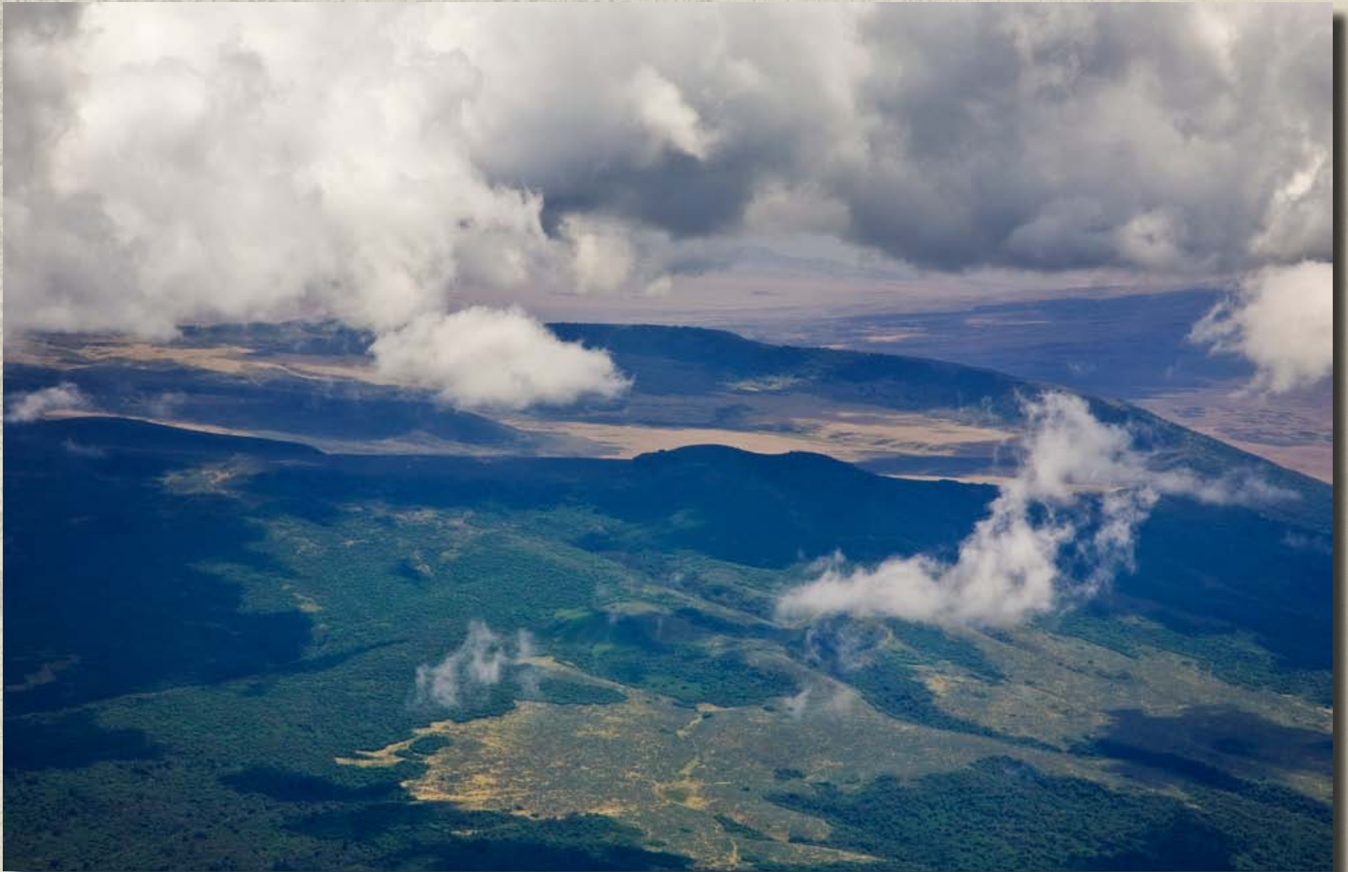
Ngorongoro Conservation Area