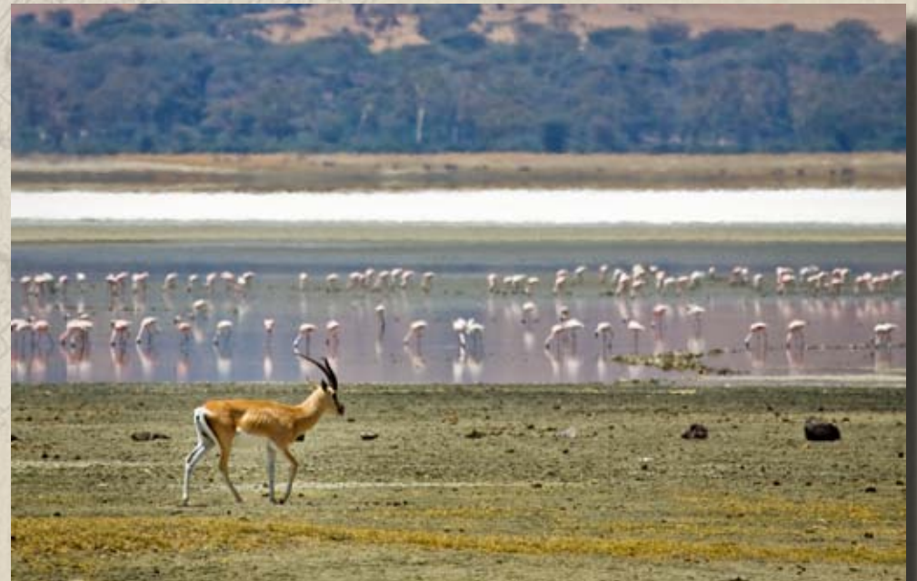
A Grant's gazelle wandering the shoreline

After a relaxing lunch, it's back to the Land Cruisers for a few more hours of wildlife spotting, then the drive out of the crater and back to the lodge. As usual, your driver is professional, friendly, and a wealth of knowledge about the crater and it's denizens.