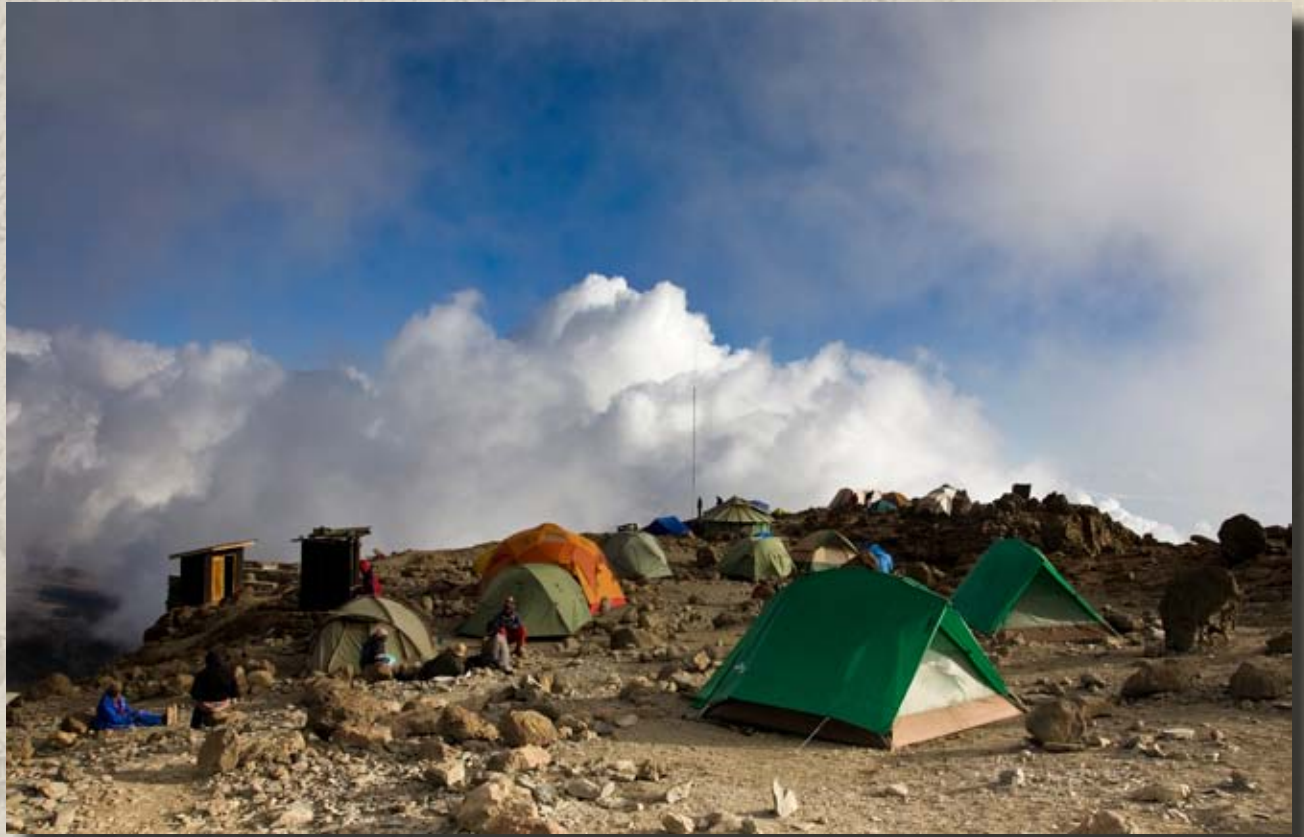
Barafu Camp (4600 m, 15,333 ft)

You go "pole, pole" up the steep slope, barely a snail's pace. Periodic breaks for hydration, snacks, bathroom, and clothing adjustments are brief, as the temperature hovers just above 0 degrees. The oxygen seems to evaporate as you ascend, every step becoming an effort. In the dark it is hard to judge how far you have come, or how much more there is to go yet you feel good, your acclimatization complete.