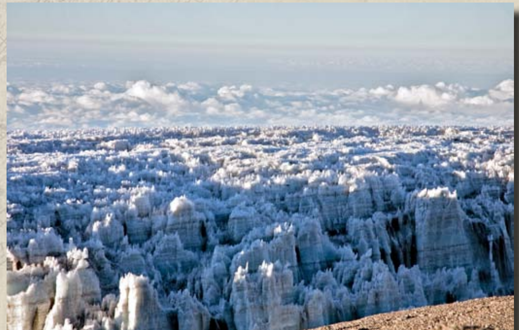
The melting surface of the Decken Glacier

There is no other view like it in the world. After a brief time at the summit, it is time to start the short 2 hour descent back to camp.