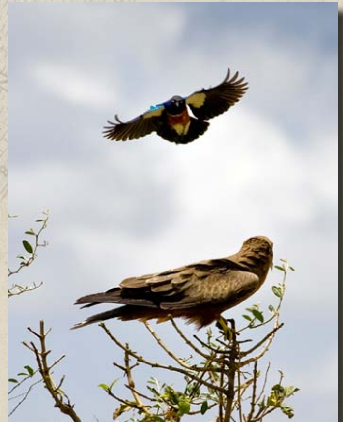
A superb starling defending its nest against a black kite