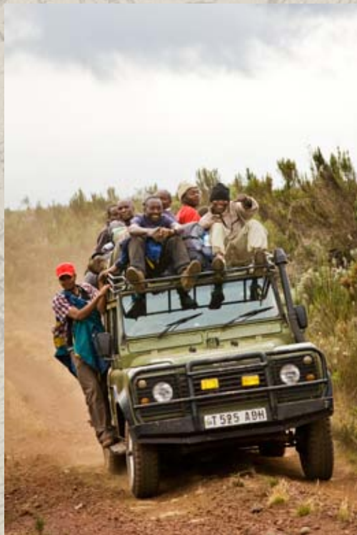
Travelling, porter style