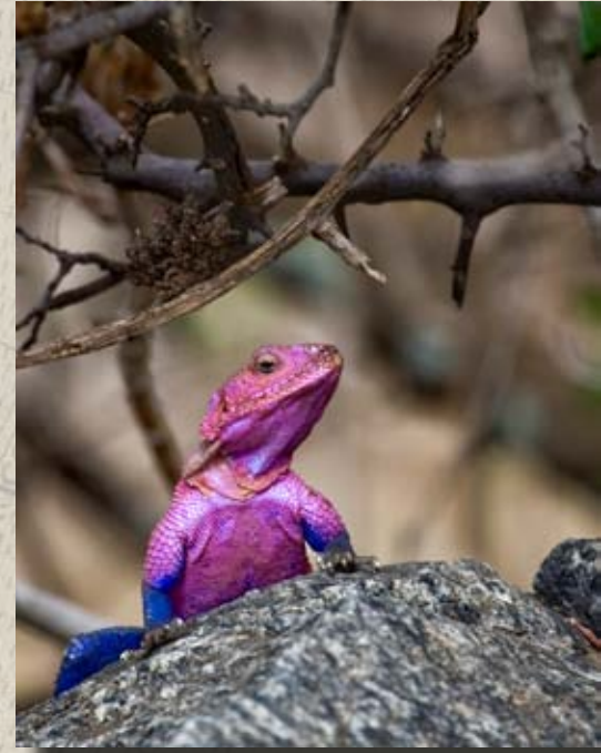
An agama lizard sunning on a rock