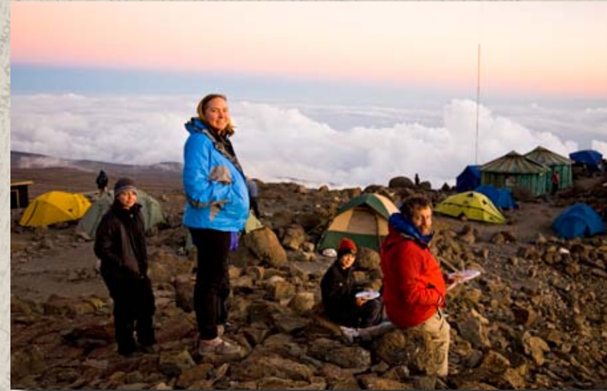
Enjoying the sunset at dinner, Barafu Camp

There is a sense of anticipation and excitement that spreads throughout the camp and between groups. You talk to people who have just come down from the summit and are preparing for the afternoon descent to the low camp, Mweka. You gaze up at the ice fields and glaciers seemingly just above you. You hydrate, hydrate, hydrate. And you rest..