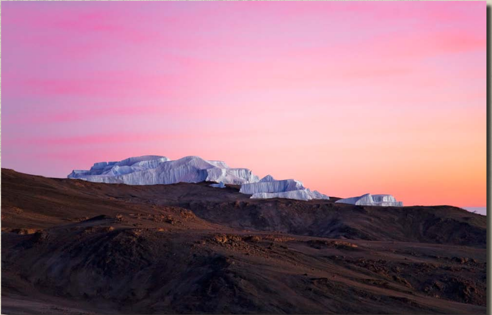
The Eastern Ice Field, just before sunrise