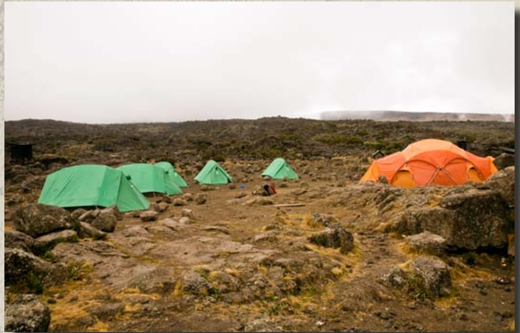
The second night's camp at Shira 2

Your only responsibilities at camp are to unpack and pack your personal gear, eat, rest and hydrate, hydrate, hydrate. You will have use of a toilet system Bio Bio provides (pictured below, right), rather than having to use the communal outhouses. It is cleaned every morning and one look in the dark, dank outhouses will make you appreciate the toilet (and the porters assigned toilet duty) even more.