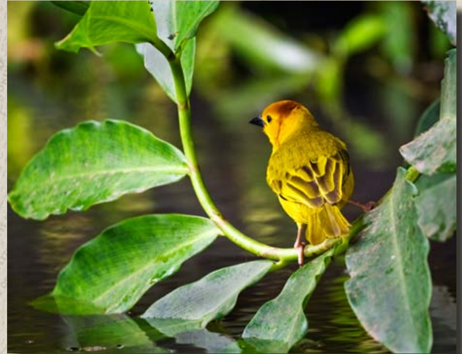
A Yellow Weaver

The safari includes the best parks of East Africa with very tasteful, high-end safari lodges. With highly qualified guides and 6 people to a Land Rover, you will be sure to see an abundance of wildlife, in style and comfort.