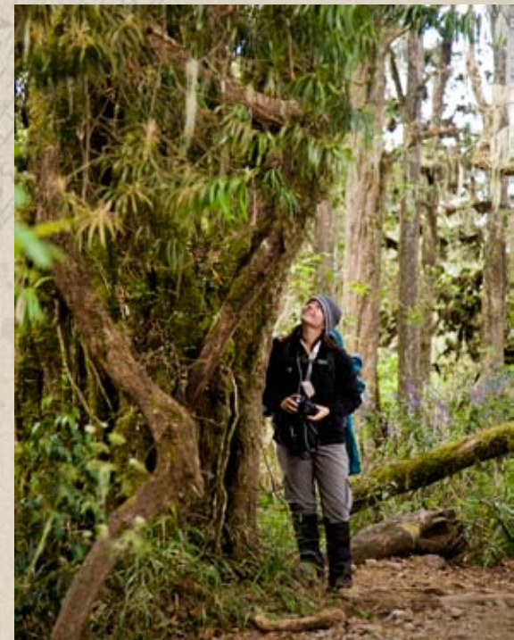
Enjoying a stroll through the rain forest