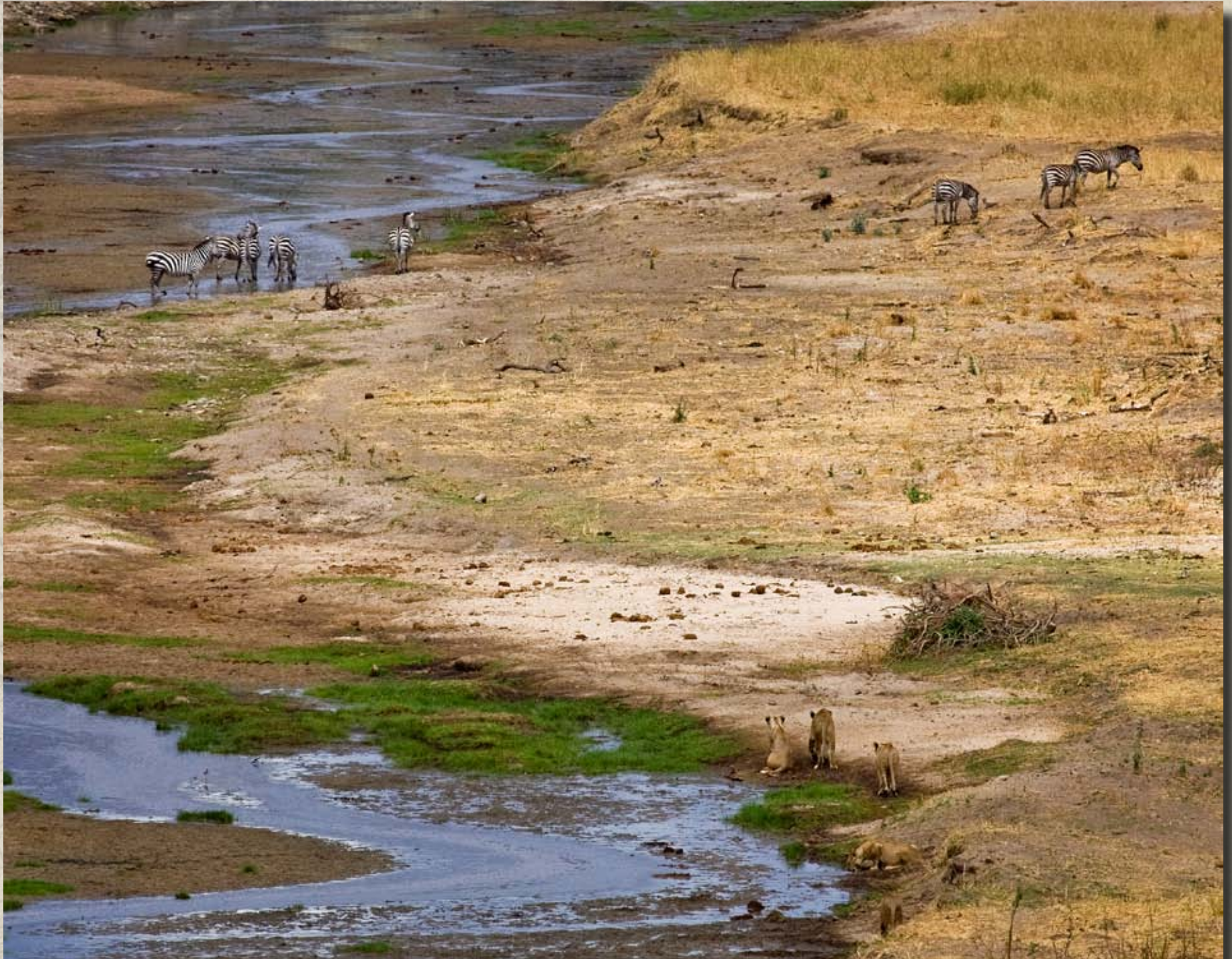
Lions and zebras along the Tarangire River