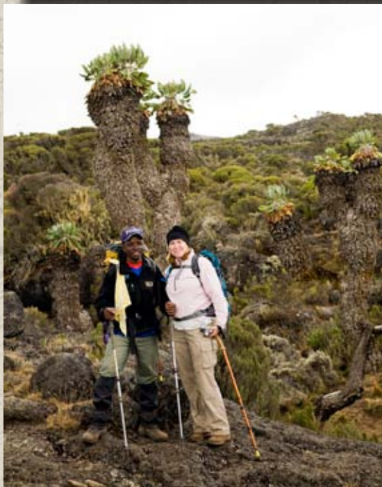
Bio Bio Guide Festo with a client in front of a giant groundsel

Your second day on the mountain is another relatively short day, with 4-5 hours of hiking to Shira 2 (3800 m, 12,600 ft). As you hike, you will learn about the unique high elevation plants and of the geology of the mountain from your knowledgeable Bio Bio guides.