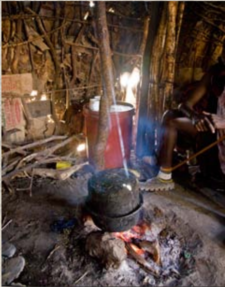
Inside a typical Maasai hut