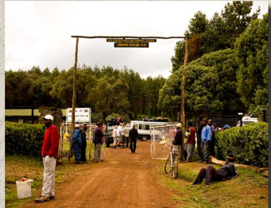
The Londorossi Gate

As you pass through the Londorossi Gate, the sense of excitement and anticipation begins to grow. The scene appears chaotic, people and gear scattered everywhere. There is an order to the chaos as everything is readied for the coming week. Once you are checked in and the gear has been sorted and packed, it is a short drive to the starting point of the trek.