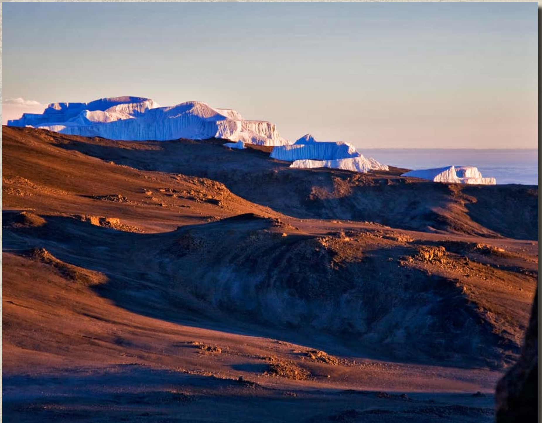
The Eastern Ice Field in the morning light