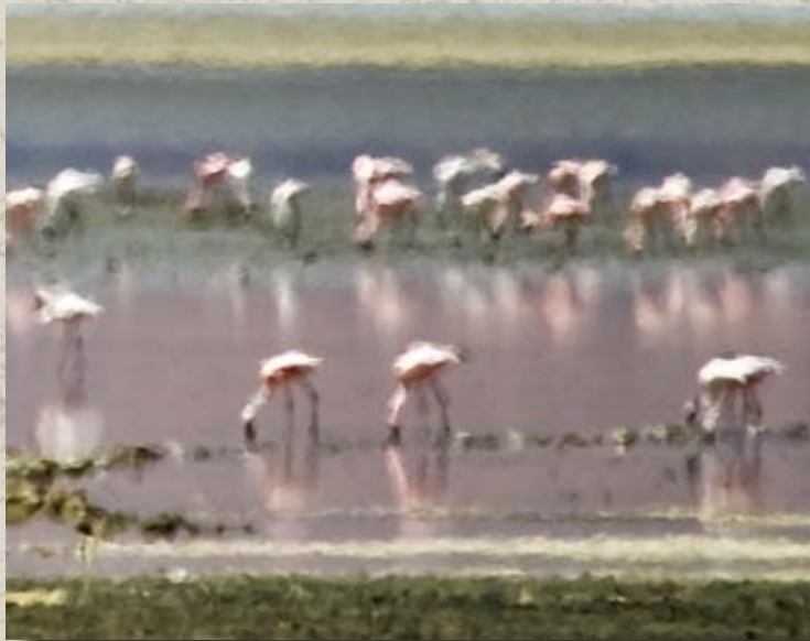
An impressionist view of flamingos, photographed at a distance, through the heat waves