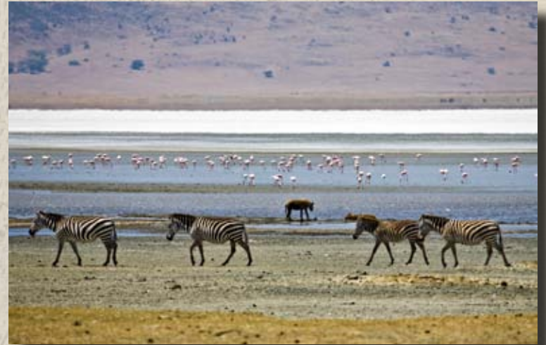
A spotted hyena drinking, while flanked by zebras and flamingos