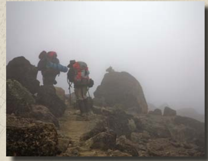
Heading into the clouds below the Lava Tower

Once at the Lava Tower it is time for a bit of rest and lunch.