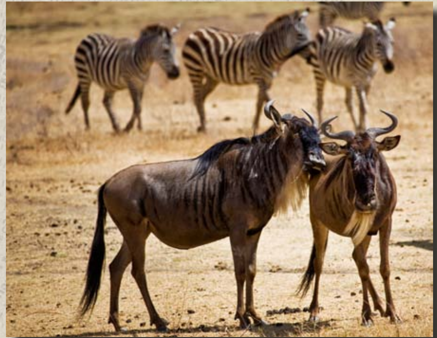
Wildebeests frolic on the grassy plain

At times the numbers will seem overwhelming, as you gaze upon herd after herd of large wildlife. You stop for lunch at the hippo pool, where you will be entertained by the kamakaze black kites, as they dive-bomb unsuspecting picnickers, snatching the food out of their hands.