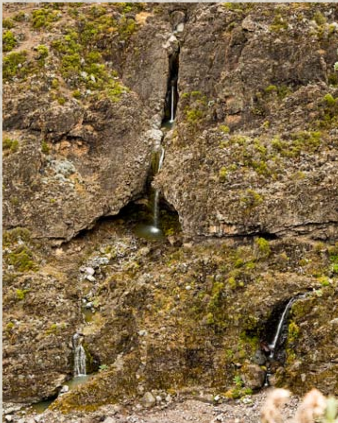
Waterfalls seen from the Barranco Wall

"It is not the mountain we conquer but ourselves." - Sir Edmund Hillary