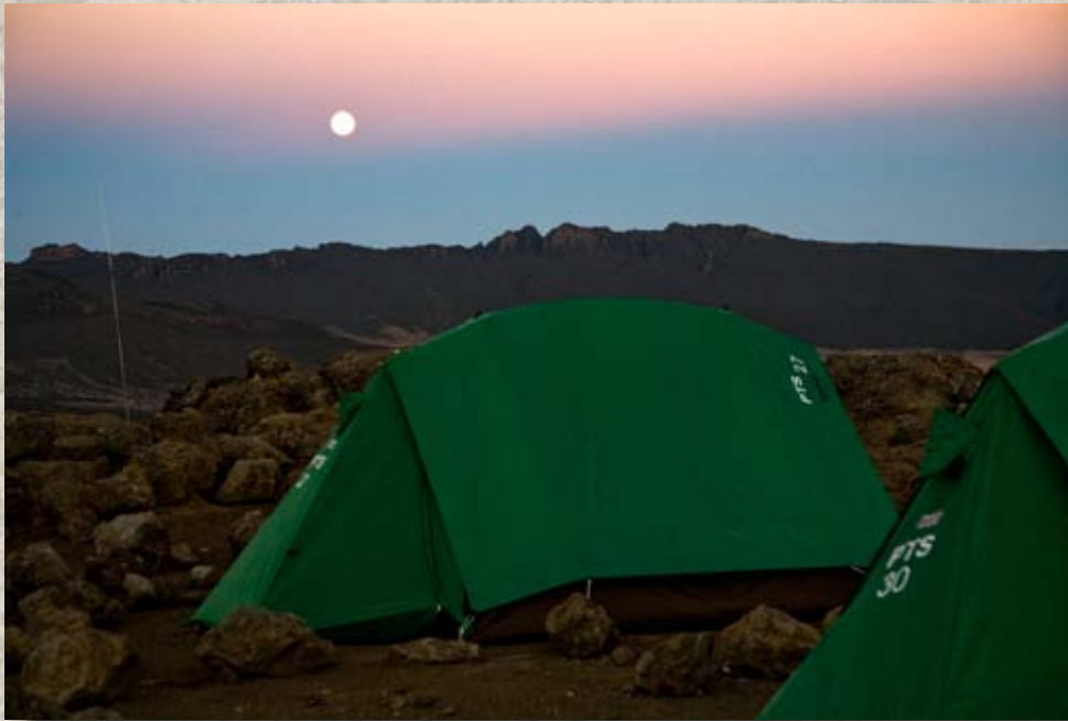
A full moon at night, at Shira 2