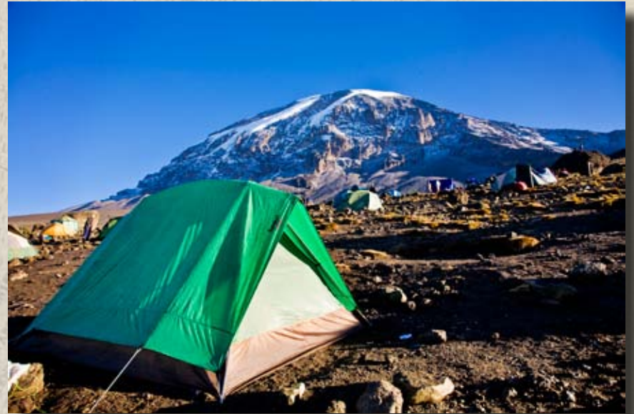
Kibo, from Karanga Camp

A slow, steady pace ensues so you don't burn too much energy, for tonight the summit attempt awaits. As you climb higher the porters remind yet again to go "pole, pole (pronounced polee)." The air gets thinner and oxygen harder to come by. Yet, you feel good after spending the past 4 days on a carefully planned route to maximize your acclimatization.