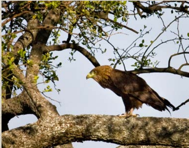
An eagle scouting for prey