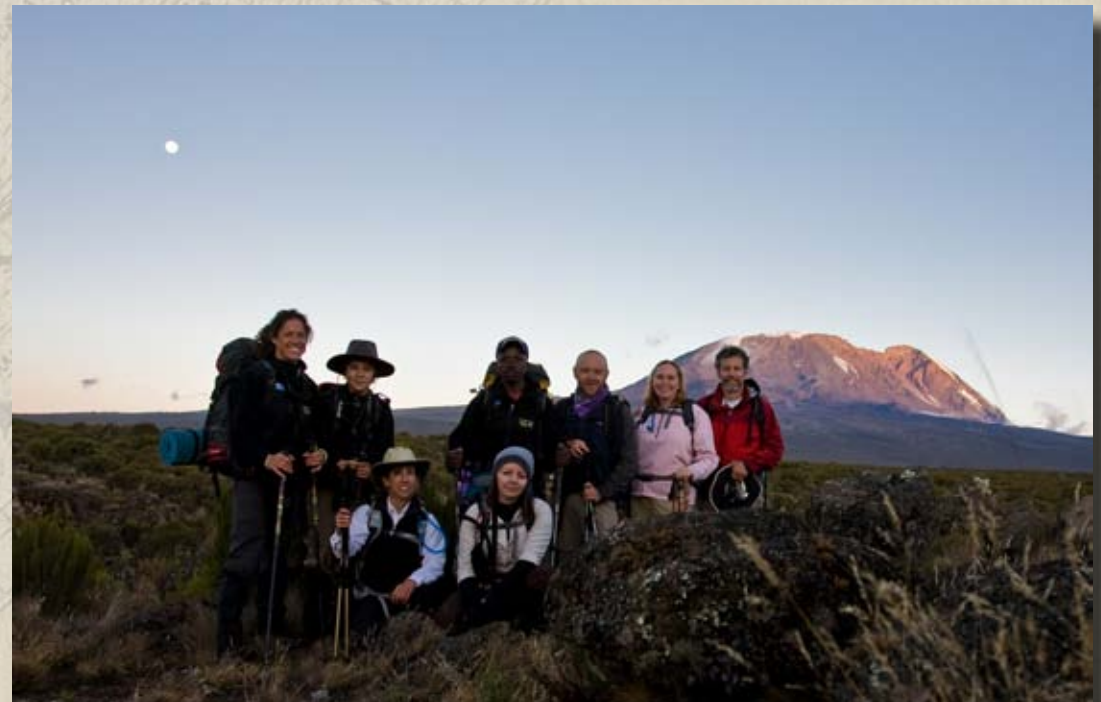
The first day on the Shira Plateau, with Kibo in the background