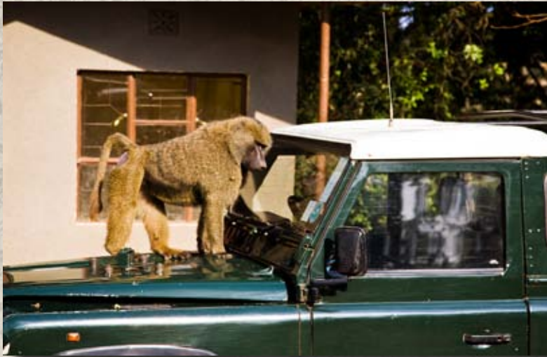
Good baboons gone bad-a baboon creating mischief at the gate to Ngorongoro Conservation Area