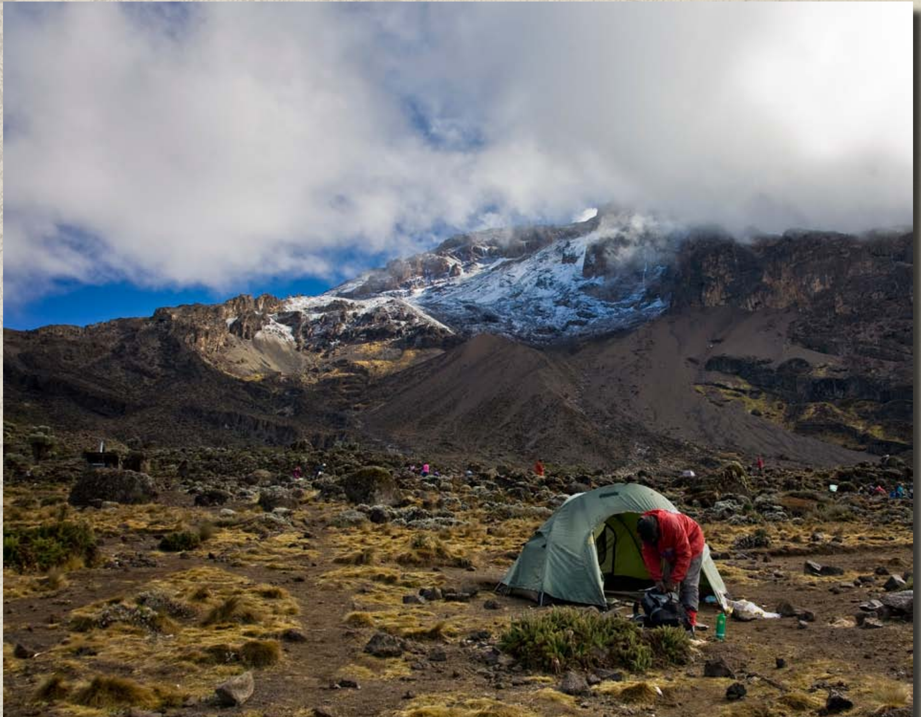
On the flanks of Kibo at the third camp, Barranco (3950 m, 13,166 ft)