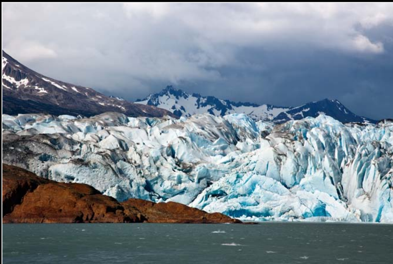
Glacier Viedma is one more example of the brilliant blue ice present in the Patagonian glaciers of Argentina and Chile.