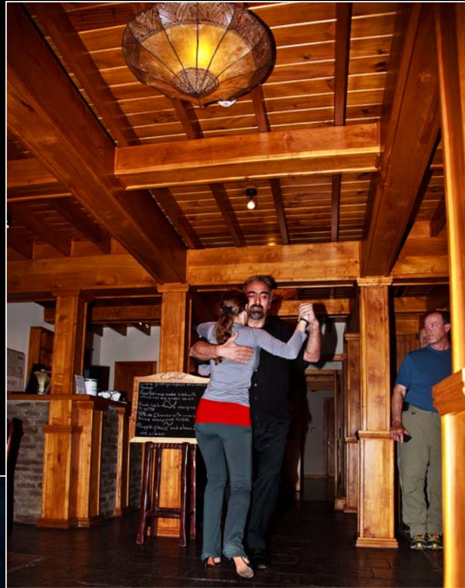
A tango demonstration is presented to the CME group at Senderos