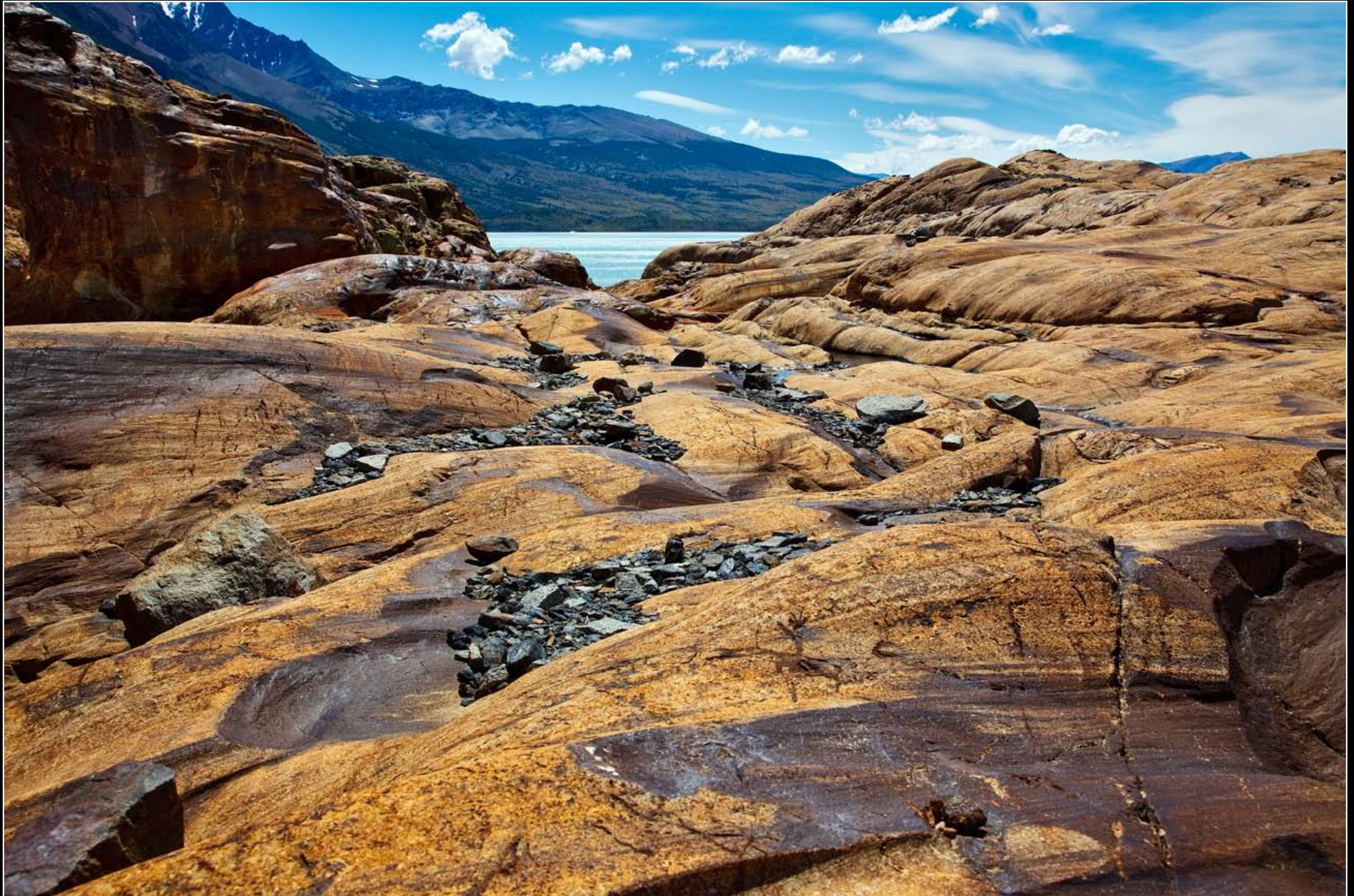
Rocks carved by the glacial movement of Glacier Viedma exhibit interesting patterns in the stone