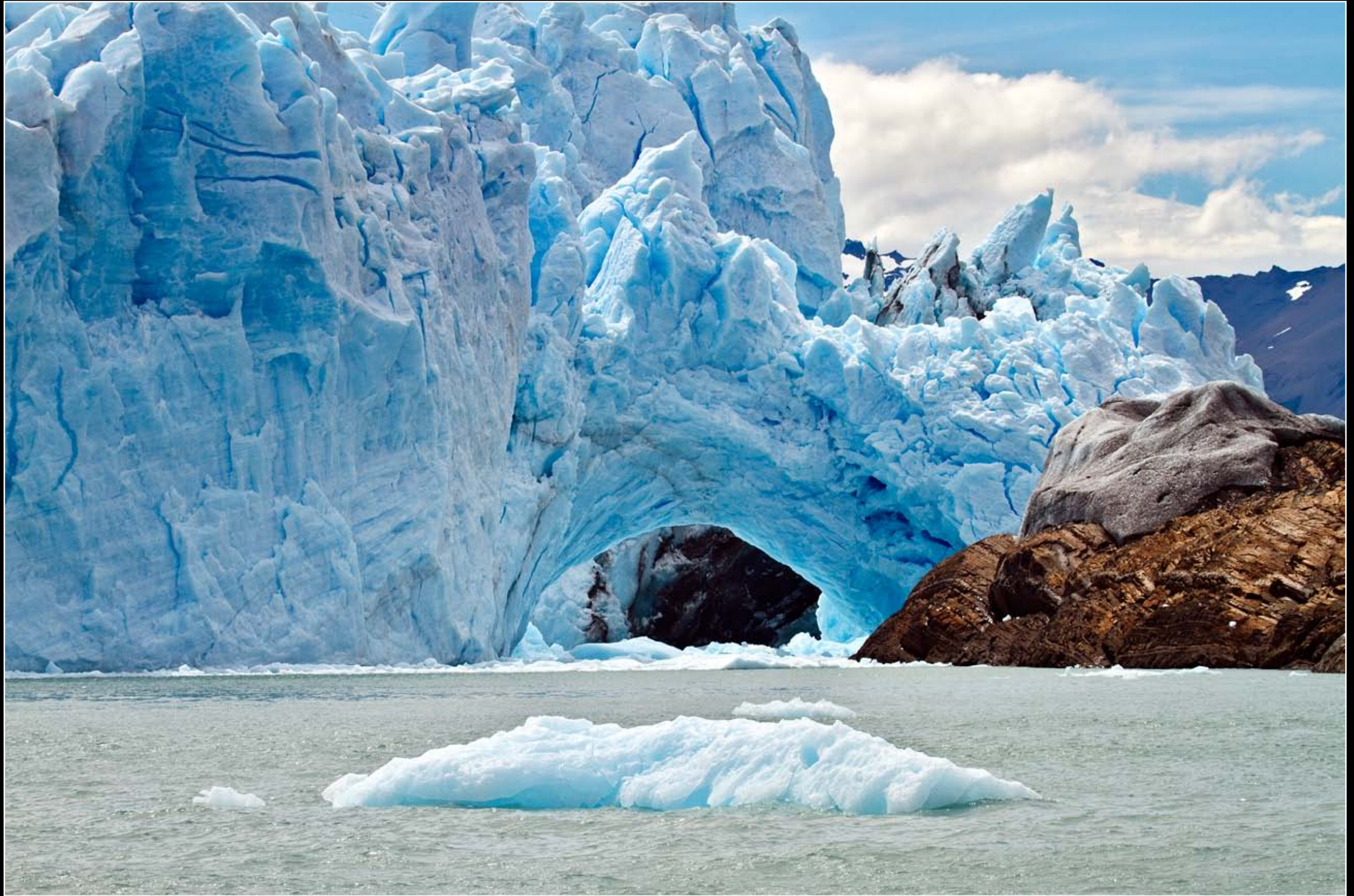
A natural arch of ice reaches the opposite shore of Lago Argentino at Glacier Perito Moreno