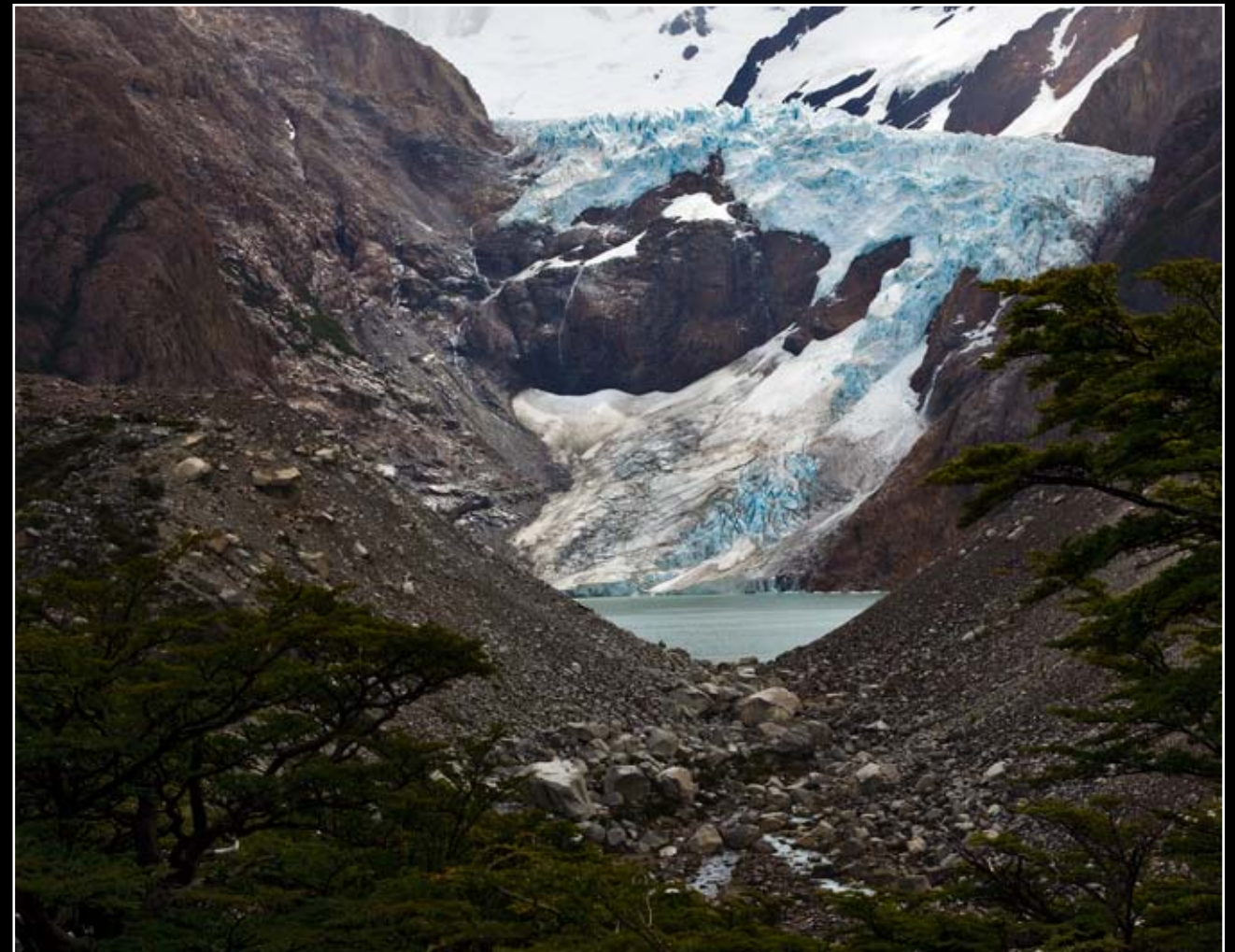
The first afternoon in El Chalten provided an opportunity for a hike to view Glacier Piedras Blancas, a hanging type of glacier.