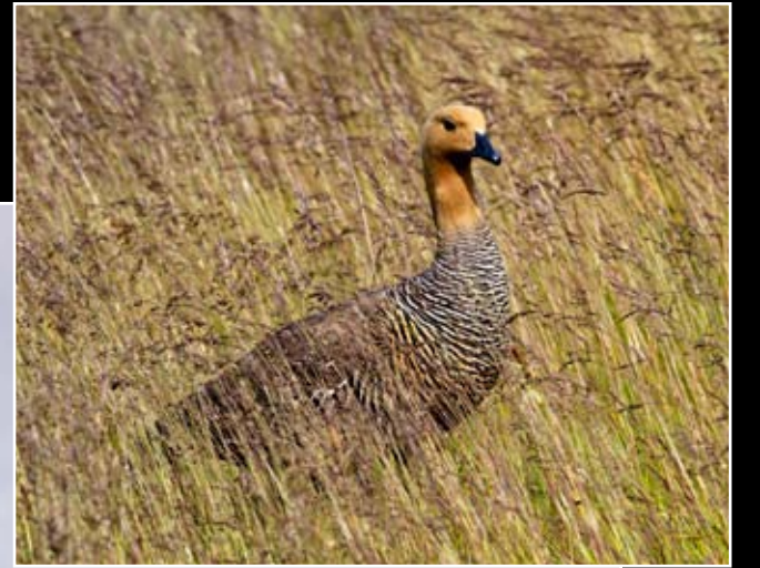
The multi-hues lakes of Torres del Paine are seen from the French Valley hike. An upland goose along the trail is pictured in the inset.