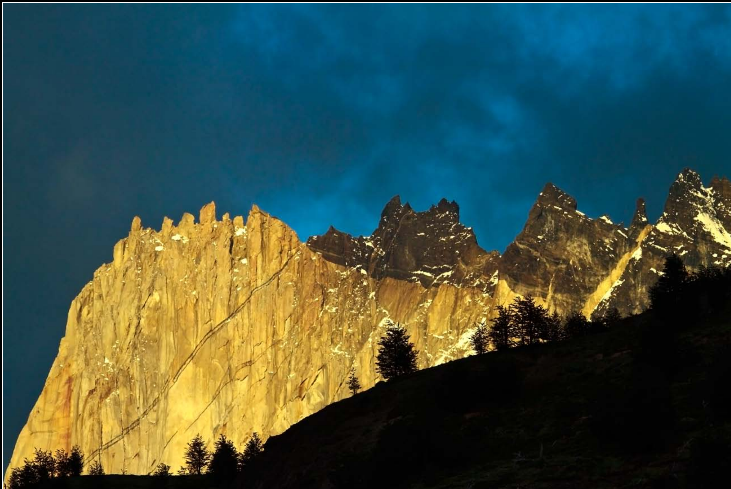
The Condor's Nest (Cerro Nido de Condor) glows in the light of the setting sun.