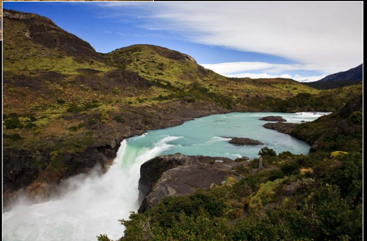
Bio Bio guide Phil Boyer photographing the beauty of Torres del Paine, with Paine Grande in the background (above), Salto Grande on the Paine River (right).