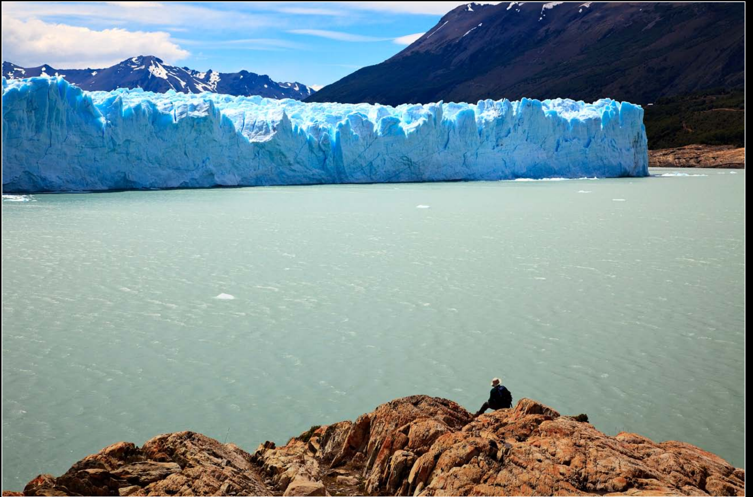
Glacier Perito Moreno, Argentina