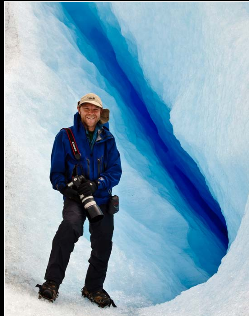
The author/photographer posing with the vivid blue ice of Glacier Perito Moreno