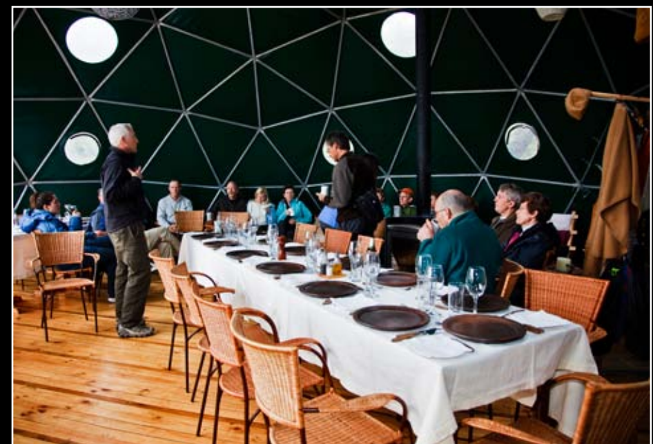
Lecture time- CME in a relaxed, casual setting.