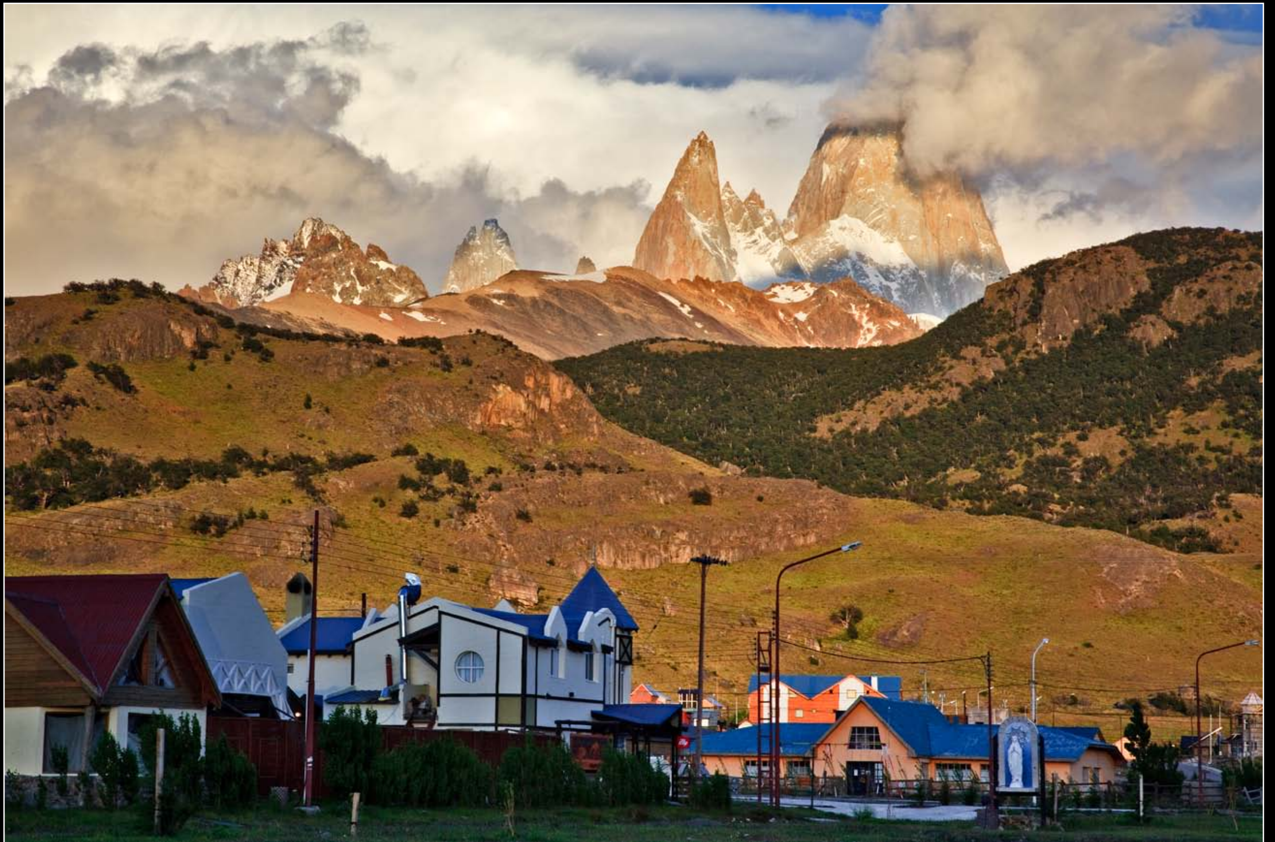
Cerro Fitz Roy & El Chalten, Argentina