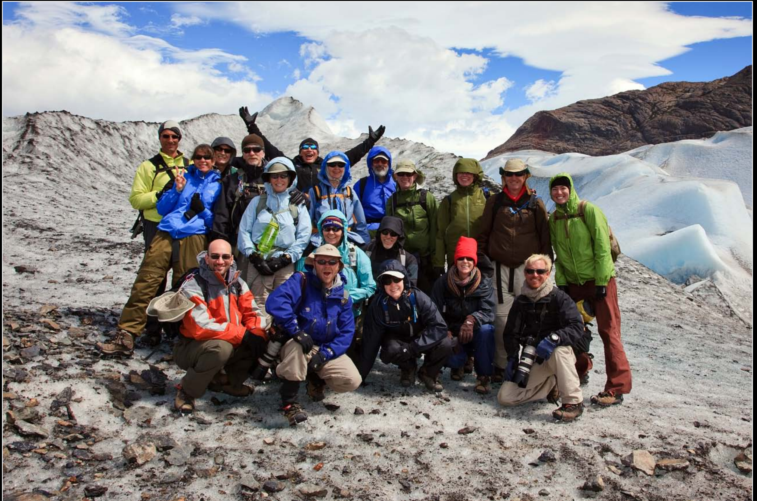
Our 2010 Patagonia Wilderness Medicine CME Group