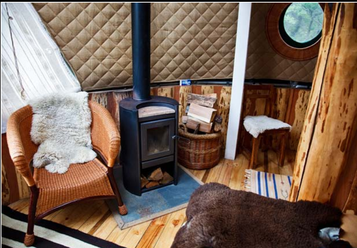
The suite domes are rustic yet luxurious, while adhering to an environmentally responsible approach..