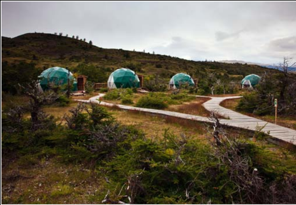
The EcoCamp provides a casual, relaxed setting in the foothills of Torres del Paine with excellent views of the towering rock spires that make this park so distinctive.