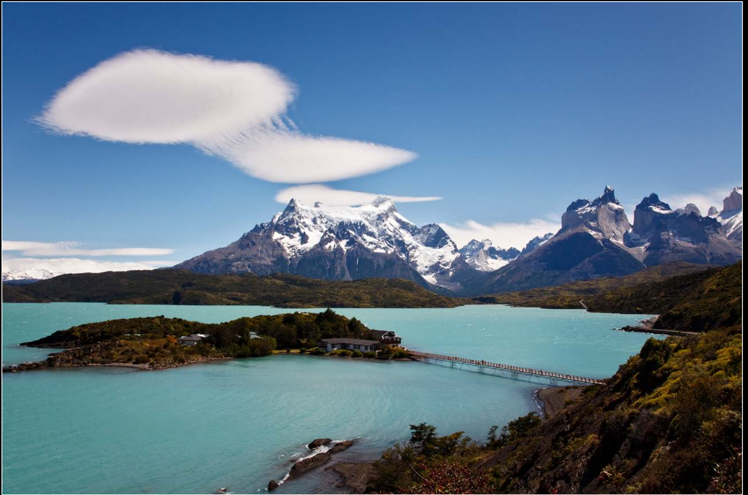
Parque Nacional Torres del Paine is a landscape dominated by soaring rock spires and tall, snow-covered peaks which also contains rolling, grass-covered hills, multi-hued lakes, woodlands, glaciers, and a multitude of trekking trails. Pictured here is Lago Pehoe, with the Hosteria Pehoe nestled on a picturesque island.