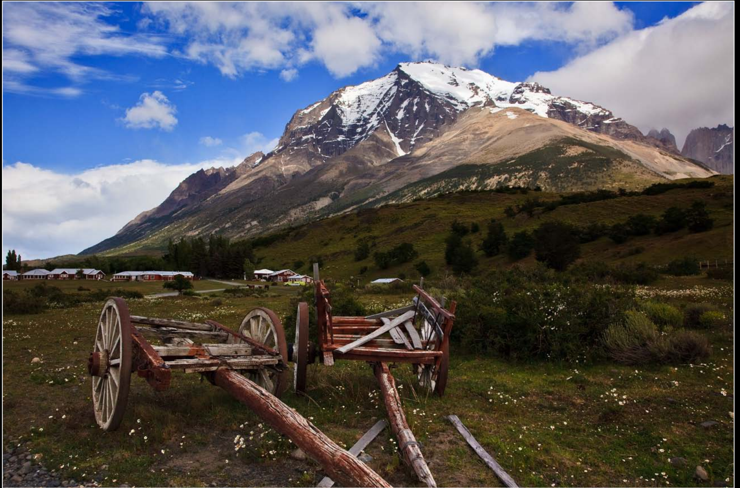
Torres del Paine, Chile